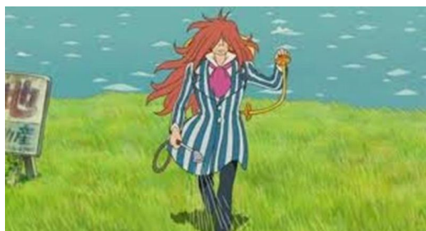
Fujimoto sprays seawater before him as he ventures on land

The ocean itself becomes a live and memorably angry character in the film. The graveyard of boats that Sosuke's father heads towards can be seen as the ocean's revenge upon the human. This is reinforced by the immense and angry looking waves that accompany Ponyo's progress towards reuniting with Sosuke and the scene's accompanying musical score that contains strong echoes of Wagner's "Ride of the Valkyries." Ponyo herself can be read as a force of nature since it is she who triggers the ocean to let loose its apocalyptic power. On the one hand we can interpret Ponyo and her sea-goddess mother as the agents of the vengeful sea but it is also interesting to note that Ponyo gains her power through breaking into her human father's collection of magical elixirs and drinking them for herself, another version of the age old fear of tampering with mysterious forces, i.e. technology. Watching this scene in the wake of the March 11 catastrophe one cannot help but be reminded of the waters spilling into the nuclear reactor.