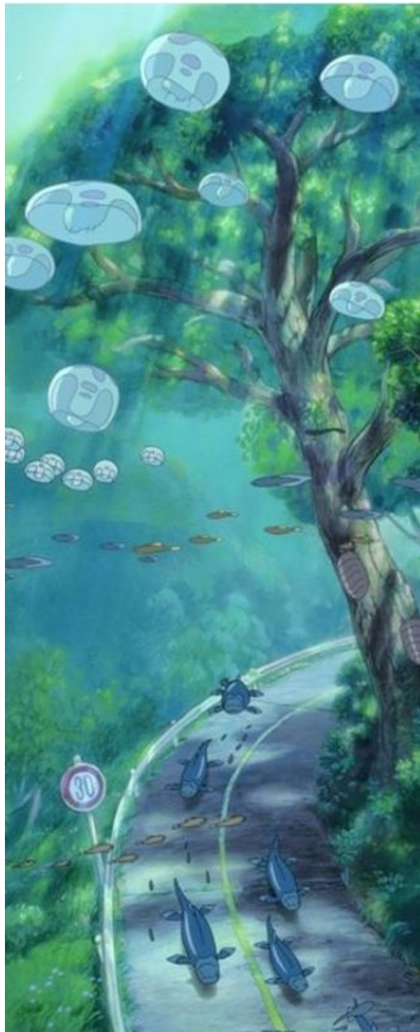
The sea restored

How to stop it? Here is where the message becomes a little cloudy in my opinion. One of my students has suggested that children in Miyazaki are in some ways reactionary forces. 6