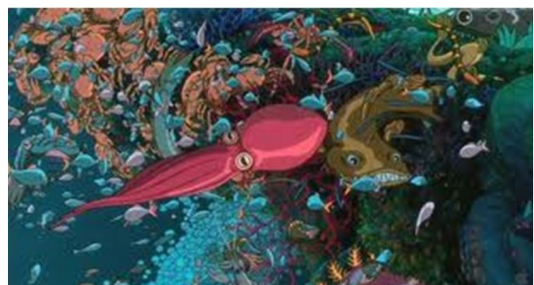
Ponyo's ocean offers viewers a powerful sense of life

But Ponyo is a family film that ultimately cannot sustain such a definitively bleak vision. Instead we are given an upbeat ending with a rather amorphous vision of love conquering all. In this case the children are reactionary agents whose love papers over the tear in the fabric of nature that they themselves had helped to create. The film ultimately shies away from its darkest implications, allowing its family audience to get remarkably close to apocalyptic trauma but finally providing them with an escape route from that condition.