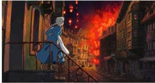
Firebombing of civilians in Howl's Moving Castle

people? Or can it also influence and move its audience, playing into subconscious dreams and nightmares that disturb contemporary people on a deep level?