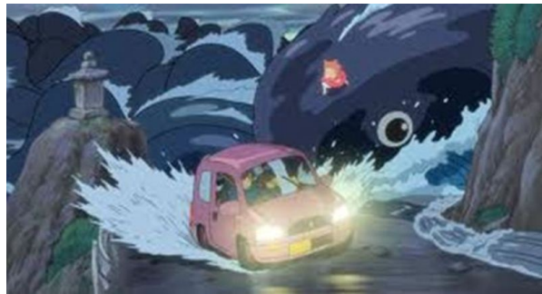
The approaching wall of water in Ponyo

The film ends happily, however, as the two children's love for each other causes the tsunami to recede and leaves the port dwellers seemingly miraculously untouched.