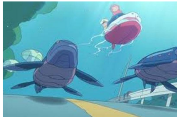
The post-disaster sea teems with ancient marine life

But the bleak reality of disaster is ultimately subsumed within Miyazaki's overall artistic vision that weaves a dreamlike child's fantasy around the catastrophe and its after-effects. Unlike the real tsunami, these scenes manifest themselves in soft pastels, shot through with golden sunshine, as if taking place in a marvelous dream world. Lyrical and largely upbeat music, composed by Miyazaki's favorite composer Joe Hisaishi, adds to the magical quality of these scenes. Not only fantasy and dream but time itself plays a role in distancing the viewer from the horror of the real. For, thanks to Ponyo's remarkable powers which have been augmented by her human magician father and sea goddess mother, the sea has devolved back into the Devonian Era of millions of years ago.