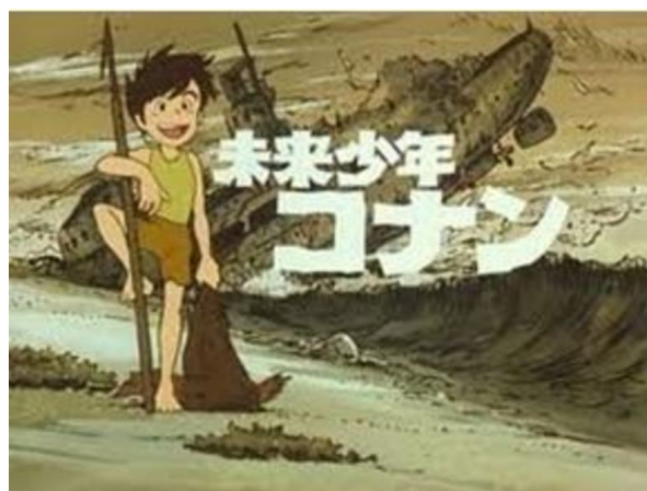
Self-reliance after civilization's end in Future Boy Conan

Indeed Miyazaki's work, since his 1970's debut television series, Future Boy Conan (Mirai Shonen Conan), which was set in a post apocalyptic world in which only a few human islands remain in the midst of a vast sea, is replete with images of disaster. Equally importantly, the films are also explorations of how humans cope with disaster. In episode after episode, Conan, the young hero of the series, uses his pluck, strength and cunning to deal with threats that are both natural and manmade, becoming the epitome of youthful resourcefulness in a threatening environment. The emphasis on Conan and his fellow young peoples' resourcefulness is refreshing but it should be remembered that this is also a convention in children's literature. Or, as Miyazaki puts it "One of the essential elements of most classical children's literature is that the children in the stories actually fend for themselves." 1