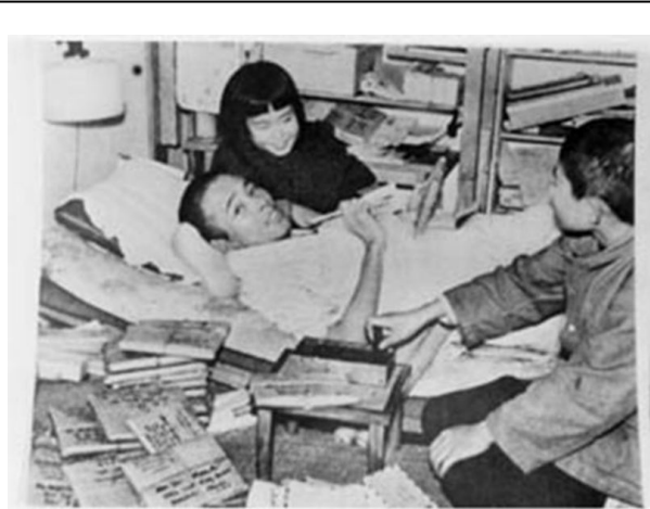
Nagai Takashi with his family shortly before his death from leukemia in 1951

Japan, from 1945 to 1952, lacked a social and political environment which permitted the free circulation of ideas and information opposed to the interests of the state. Under the Allied (in reality, American-led) Occupation, a regime of censorship prevailed in which information about the physical and human damage inflicted by the atomic bombings could not be published. 4 Most ordinary people would have had little or no knowledge of what an "atomic bomb" was, or of the effects of radiation on human flesh, still less of the true extent of the devastation of Hiroshima and Nagasaki. Newspapers initially called the bomb a "new-type" weapon without specifying how it was a unique weapon. Similarly, the Emperor's famous speech announcing Japan's defeat only mentioned that the enemy possessed "a new and most cruel bomb" capable of causing "incalculable" damage. Towards the end of the Occupation, some cracks in the censorship appeared. One text which made it to press was a famous memoir by a Nagasaki physician and Catholic, Nagai Takashi, called Nagasaki no kane (The Bells of Nagasaki). The Occupation authorities, however, agreed to its publication only with inclusion of an appendix which detailed the Japanese invasion of Manila - a decision which, as Dower and others have