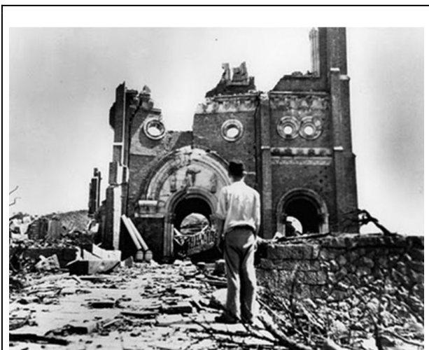
The ruins of Urakami Cathedral in 1945

It was the providence of God that carried the bomb to its destination. ...Nagasaki, the only holy place in all Japan - was it not chosen as a victim, a pure lamb, to be slaughtered and burned on the altar of sacrifice to expiate the sins committed by humanity in the Second World War? 11