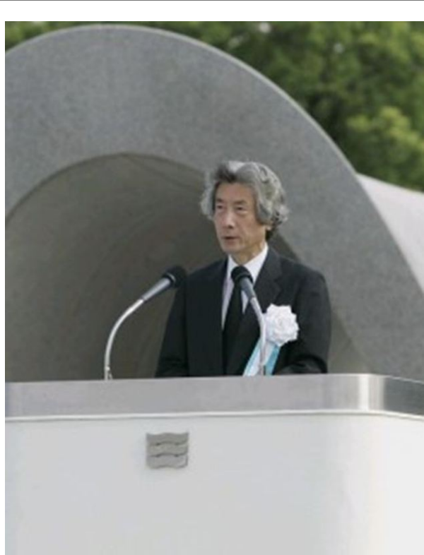
Koizumi speaking at Hiroshima in 2005

What alternative understandings does this official reading elide? In the immediate post-war period, "Hiroshima and Nagasaki" in Japan were not instantly held up as national symbols of "peace," and even less so as signifiers of "culture" - two deeply ambiguous terms assumed to be phenomena with homogenous, universal meanings and values. In fact, for the first decade after the end of Japan's war in Asia, the two A-bombed cities remained firmly in the shadow of other major events: the Allied Occupation of Japan, the start of the Cold War and the crackdown on Communism, and the Korean War. It hardly helped that the hibakusha (victims; literally, "explosion-affected people") of both cities were often feared and socially marginalized. Many of them had faces and bodies grotesquely damaged by heat and radiation from the explosions; many of them were considered tainted with the contagious poison of the atomic bombs. 2