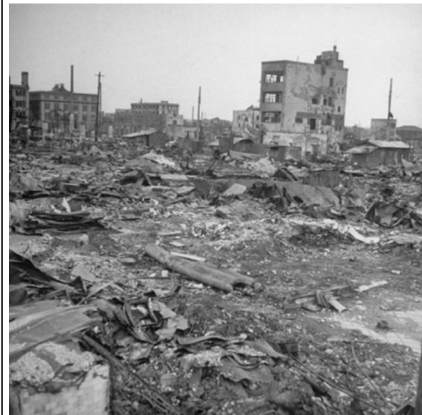
Tokyo in ruins after American firebombing in 1945

In fact, as earlier mentioned, Hiroshima and Nagasaki had not yet become the focal points of the narrative of Japanese national suffering in the Asia-Pacific war. By the time of Japan's surrender, 66 Japanese cities - including Hiroshima and Nagasaki - had been fire-bombed, leaving many of them in ruins not dissimilar to the destruction in the two atom-bombed ones. A good illustration of this comes from how some members of the Diet opposed a proposal to pass laws that would release extra public funds to the two atomic-bombed cities for reconstruction. Many other cities had been bombed and suffered high casualty tolls, they said; on what grounds should Hiroshima and Nagasaki be singled out for special treatment? 6