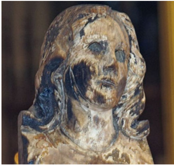
A Madonna scarred by the bombing serves as a powerful symbol in Nagasaki

But what is it based on? Nagasaki is often treated as the "passive" city in opposition to "active" Hiroshima, despite there being little political or economic basis for this distinction. Beginning in the mid-1950s, for instance, activists and officials in both cities scrambled to install new bomb-related organizations and monuments - hibakusha support groups, atomic bomb hospitals, and peace museums. 22 If Nagasaki appears to lag behind Hiroshima in comparisons of the quantity and timing of the two cities' officially sponsored activities (e.g. city councils established to serve hibakusha needs), the difference in each city's size and revenues must be taken into account: Nagasaki has a population under half of Hiroshima's, which puts it at a financial disadvantage relative to Hiroshima. 23 Without concrete reasons to distinguish between Hiroshima and Nagasaki as "active" and "passive" cities, ikari and inori are best seen as a phenomenon whose root influences are social and cultural in nature. This simplistic binary overlooks the fact that anger and prayers have always simultaneously existed among the people of both Nagasaki and Hiroshima, and it glosses