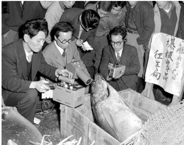
Testing tuna for radioactive contamination following the Lucky Dragon No. 5 incident

Still, it is apparent that a widespread national consensus on Hiroshima and Nagasaki as the foci of Japanese suffering as victims of atomic bombs did not emerge till after 1954. In that year, a fishing boat ironically named the Lucky Dragon #5 became the accidental victim of a U.S. hydrogen bomb test, sparking a national anti-nuclear movement and interpretations of Japan having suffered a "third bombing." 8