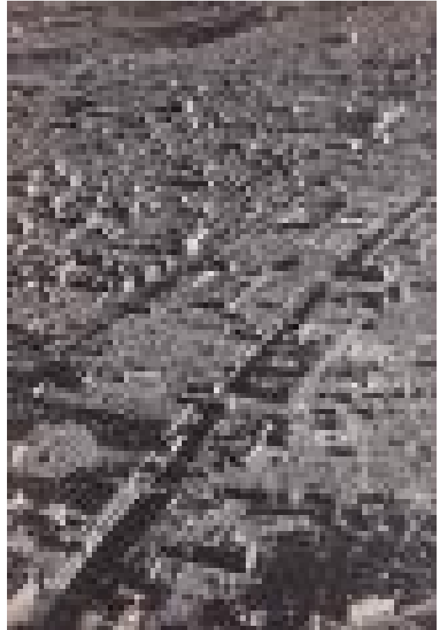
Tokyo following the firebombing of March 10, 1945

The firebombing of Tokyo, or for that matter the bombing of any city, whether it be Hiroshima, Nagasaki, Dresden or London, cannot be fully comprehended unless it is examined in the context of the history of indiscriminate bombing throughout the twentieth century.