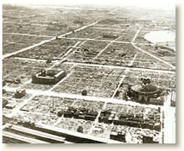
Central Tokyo in ruins after the March 10 firebombing

The aim was to cause maximum carnage in an overcrowded city of flimsy wooden buildings; an estimated 100,000 people were 'scorched, boiled and baked to death,' in the words of the attack's architect, General Curtis LeMay. It was then the single largest mass killing of World War II, dwarfing even the destruction of the German city of Dresden on Feb. 13, 1945.