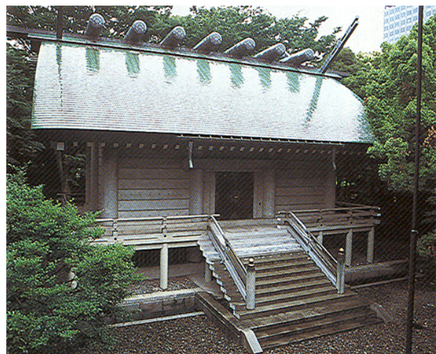
The Repository

main sanctuary at Yasukuni, there are files, presently being digitalized, containing personal details. The latest shrine figures for the dead are as follows: the Manchurian 'incident' 17,176, the China war 191,250, and the Pacific war 2,133,915. I say 'the latest figures' because those for the Pacific war change. Last year, the shrine enshrined 12 new kami. Families of the war dead inquired of the shrine whether their fathers, brothers or uncles were venerated at Yasukuni; the shrine carried out checks and discovered that these names were not in the archive. The dead were duly transformed into kami through a rite of apotheosis. [2]