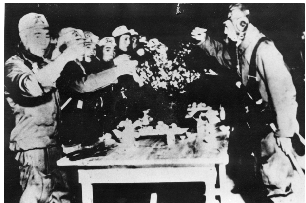
Photograph of send off of a group of Kamikaze found on the body of a pilot shot down in the Solomon Islands. The confident gaze of their commander contrasts with the uncertainty of the kamikaze.

Allied Forces to make concessions so as to end the war as quickly as possible to avoid further Allied casualties by kamikaze attack. However, as testimonies of dead and surviving pilots clearly show, their idea of "country" was far from the nationalistic notion of "nation-state." For most of these young students, "country" meant their own "beautiful hometowns" where their beloved families lived. In this context it is interesting to note that there is very little reference in their wills, letters-home, and diaries of their loyalty to the emperor. Occasionally we find some stereotypical militaristic phrases such as "Kokoku Goji (Uphold the Empire)," "Shinshu Fumetsu (the Immortal Divine Land)," "Yukyu no Taigi (the Noble Cause of Eternal Loyalty)," and the like, but these words are usually used rhetorically rather than conveying deep conviction or abiding nationalistic sentiment.