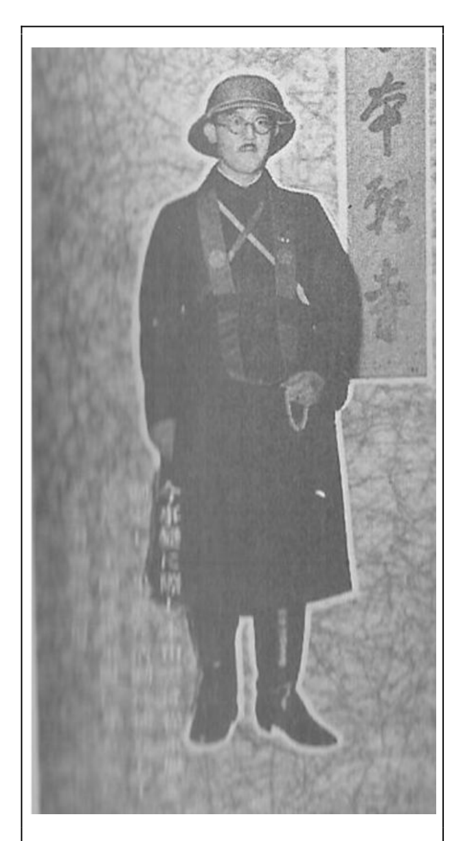
Buddhist military chaplain

Unlike US military chaplains, Buddhist chaplains did not wear military uniforms, but their military boots and pith helmets made it clear that they, too, were part of Japan's military effort. Many commanders found it comforting to have their unit's Buddhist chaplain accompany them on periodic tours of the front lines based on the belief that the priest's allegedly miraculous powers would insure their safety.