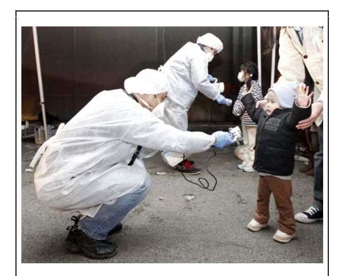
Child undergoing a radiation check

The April 3, 2011 edition of Newsweek described the current situation in Japan as follows: