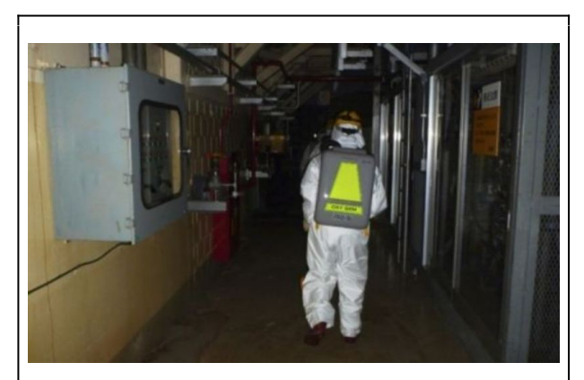
Worker in the early days of the Fukushima accident

In the years since the advent of the Heisei period (1989), Japan has experienced numerous crises, ranging from political, financial, and social turmoil to natural disasters, as if inheriting the turbulence of the previous eventful and painful Showa history (1926-89). In the face of calamity, however, the Japanese people have always impressed the world with their extreme resilience and what is often referred to as their "stoicism." It has been generally suggested that the Japanese people are impressively responsive to disasters, given their all too frequent experience of calamity in an island country located on the Pacific "rim of fire."