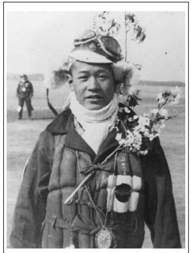
Kamikaze pilot covered in cherry blossoms

"practical work" on the battlefield lay a metaphysics that promoted a value that became increasingly important the longer the war lasted - resignation to one's death. Buddhism was seen as providing the quickest route to acquiring the needed resignation, for it was Buddhism that taught living means to suffer since neither human nature nor the world we live in are perfect. During our lifetime, we inevitably endure physical suffering such as pain, sickness, injury, old age, weakness, and eventually death; and we have to endure such psychological suffering as sadness, fear, frustration, disappointment, and depression. Thus, life in its totality is imperfect and incomplete because our world is subject to impermanence. Since we are never able to keep permanently what we strive for, we must accept that we ourselves as well as all we hold dear will inevitably pass away.