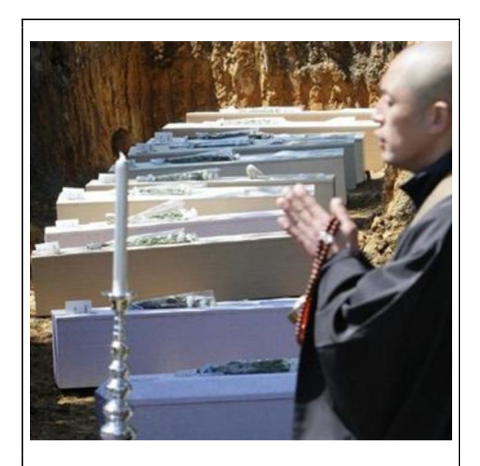
Buddhist priests and coffins of tsunami victims

Just how closely Buddhism is connected to suffering can readily be seen in Buddhism's basic teachings as encapsulated in the Four