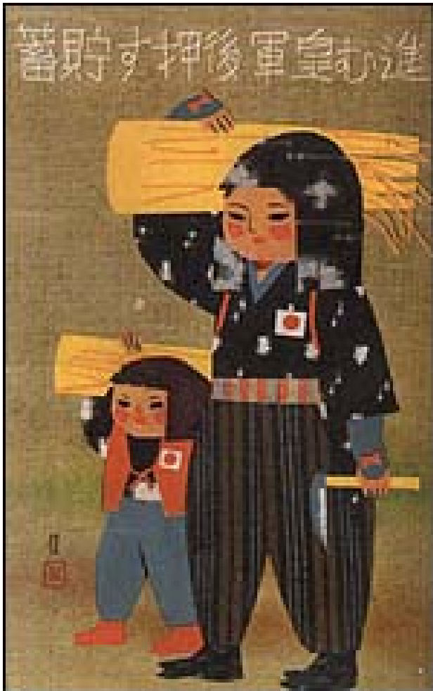
A postcard from the early 20th century urges Koreans to save money in order to support the Japanese military.