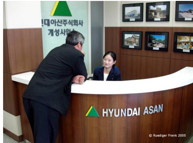
North Korean Employees at Hyundai Asan's Office in Gaeseong

The logical consequence is the urgent need for modernization, the introduction of advanced technology, securing a stable energy supply, the import of capital and the development of an institutional and human resource capability to interact on the international scene. This is behind Pyongyang’s focus on intensified economic training measures for its officials, and the background of the recent news about eased regulations for direct investment in North Korea (Hankook Ilbo, 2005-11-30). This is even more so since normalization with Japan and the expected financial support related to that deal are not out of reach, but still too far away.