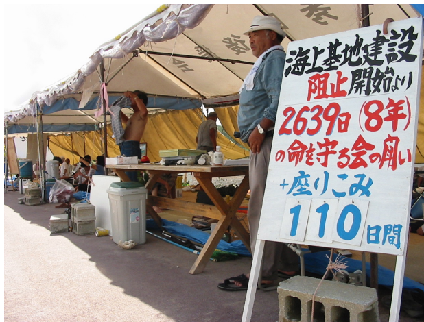
Day 110 of the Henoko anti-base struggle

In this situation, anything could happen, even an act of terror. Faced with an opponent who monopolizes the means of violence to such an unequal degree, it is understandable that the people insist on the right to possess means of resistance and to use them. I would not be surprised if acts of resistance were to occur tomorrow, in Nagatacho, Ichigaya, Kasumigaseki, or Okinawa. The present Agreement is not a prescription for dealing with "newly emerging threats," but a device to stir up such threats.