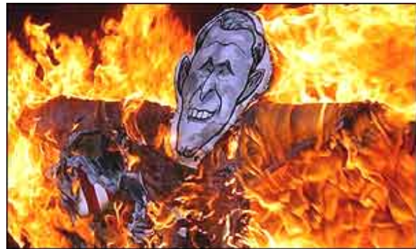
Anti-Bush demonstration in South Korea

rise as a regional power that contrasted dramatically with North Korea's demise as well as the improving political situation during the Kim Dae-jung and Clinton administrations, made the concept of a unified Korea and the notion of pan Korean nationalism something achievable and tangible.