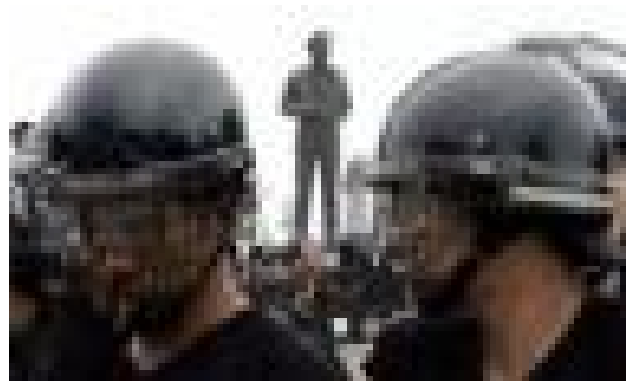
Protecting the MacArthur statue from demonstrators

into a symbolic battle between the new and the old generations. The anti-MacArthur movement is a branch of the larger anti-American movement that has identified the statue as embodying one of the greatest American betrayals of Korea. One leader of the movement explained the rationale this way: “it is time to reappraise MacArthur’s role in history. If it were not for him, our country would not have been colonized and divided as it was.” In effect some members of the anti-MacArthur group apparently would believe that unification under North Korea would have been a good thing and that it was tragically thwarted by U.S. interference.[6] Such a stance is also, of course, a fundamental challenge to the legitimacy of the South Korean state that these critics see as essentially a colony of the American Cold War empire. Although this view is still in the minority, the ambiguous standing of the ruling Uri party indicates a leaning toward supporting that revisionist view. This is but the latest public demonstration of growing anti-Americanism that the U.S. Congress has found so disturbing that it sent a letter of protest to President Roh with an offer to move the statue to a place of honor in Washington.[7]