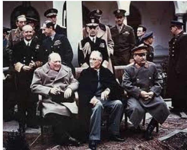
Churchill, Roosevelt and Stalin at Yalta

With regard to the first assumption, I have to point out that two very important options were available to Americans. And in fact, the options were presented in the course of the deliberations of the US government. The first option was to welcome Soviet entry into the war. By the end of 1944, US leaders had come to the conclusion that in order to force Japan to surrender, invasion of Japan's homeland would be necessary. The successful execution of this strategy would require Soviet entry into the war in order to pin down the Japanese forces in China and Korea.