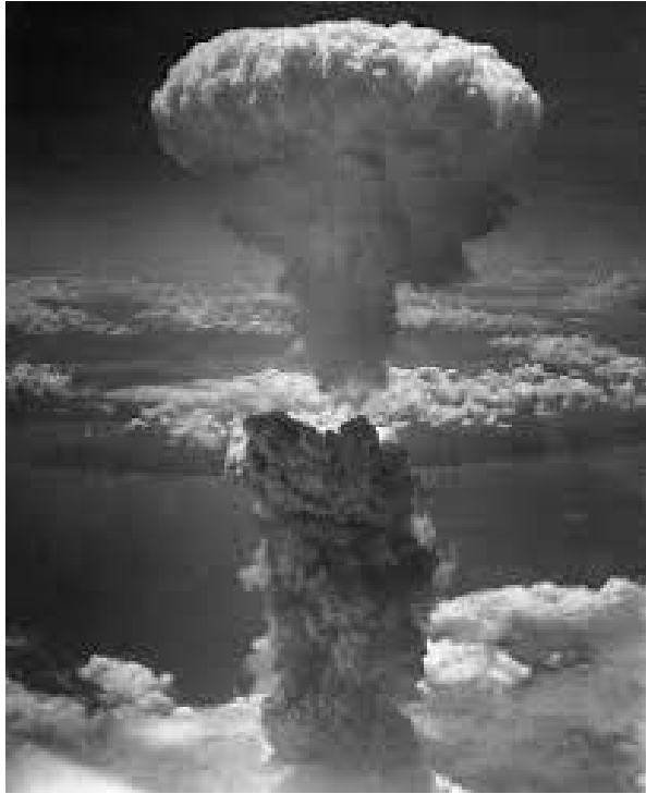
Iconic image of the Hiroshima bomb