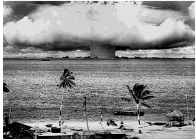
“Bravo Shot” H-bomb test, Bikini, March 1, 1954