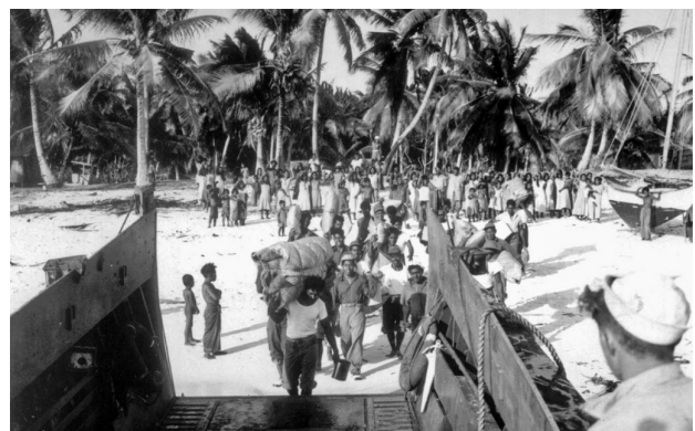
U.S. military forcibly evacuating Marshall Islanders from Bikini Atoll