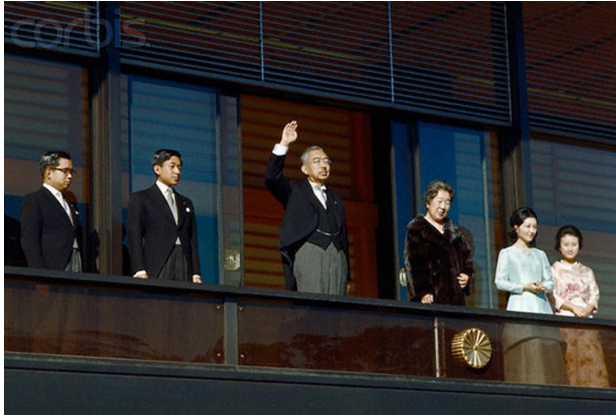
Scene of the Pachinko Ball Attack, Emperor Hirohito at the Imperial Palace, New Year 1969