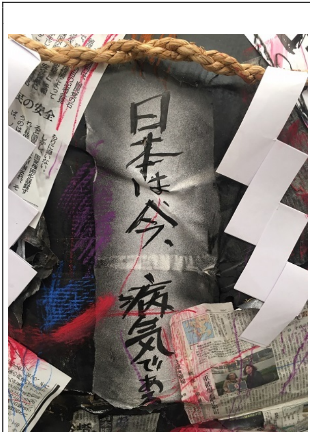
Nakagaki Katsuhisa, "Portrait of the Period - Endangered Species idiot Japonica."

In one sense, the reaction by the Japanese establishment bore out the worst fears of the Aichi curatorial team and seemed to confirm the old dictum that censorship reflects a society's lack of confidence in itself. Okamoto Yuka, a member of the Freedom of Expression Organizing Committee, called the shutdown an act of "artistic violence" and blamed not just the shifting political climate under Prime Minister Abe Shinzo but a worldwide clampdown on freedom of expression. The Japanese government's response was mealy-mouthed at best. Suga Yoshihide, the chief cabinet secretary, called the threats against the exhibit wrong "generally speaking". A month later, the Agency for Cultural Affairs pulled Yen 78 million in subsidies for the Triennale because of "inappropriate procedural matters." Education Minister Hagiuda Koichi, who is in charge of the agency, denied he was in effect telling the rightwing mob that violent threats work. The decision to terminate the funding was based solely on "whether the event could be properly managed and organized," he said, to widespread skepticism.