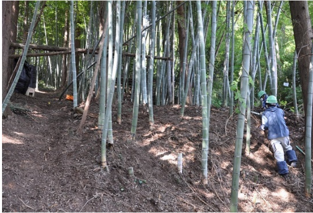
Decontamination work, Nihonmatsu, Fukushima.