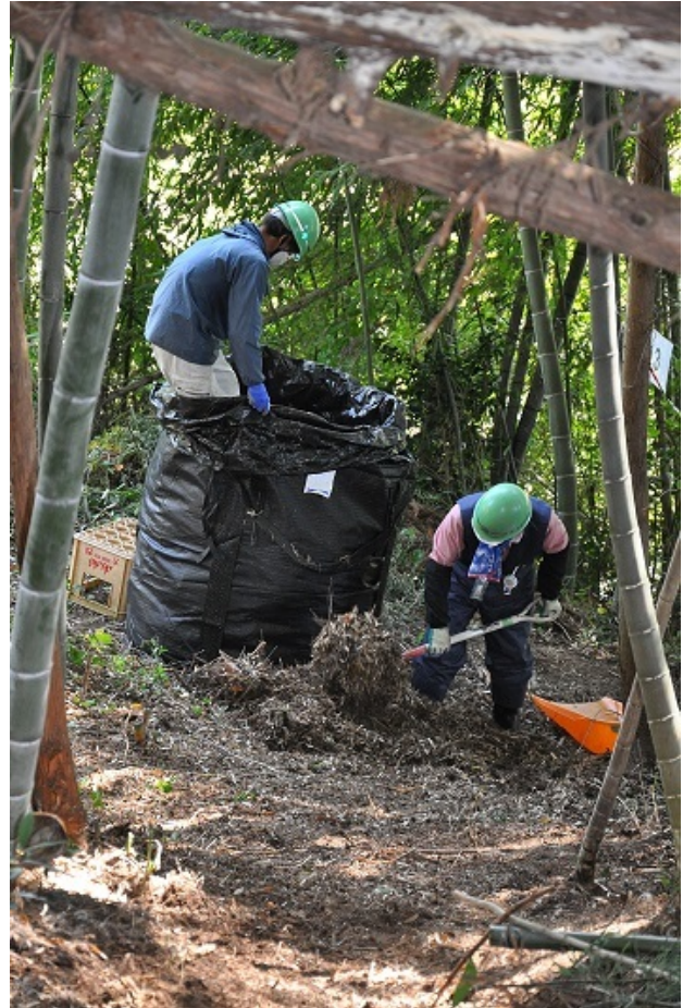
Decontamination work, Nihonmatsu, Fukushima.

Keywords: Nuclear waste, radiation, decontamination, ethnography, Fukushima