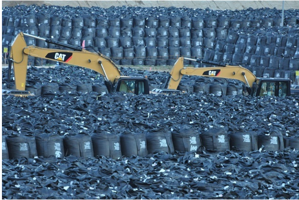
Radioactive soil depot, Iitate, Fukushima.