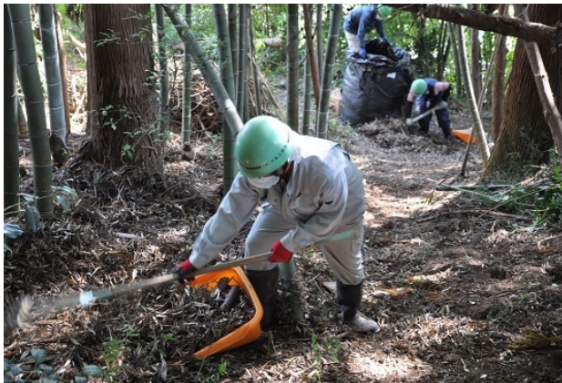
Decontamination work, Nihonmatsu, Fukushima.