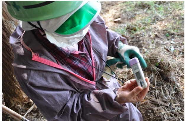
Woman with dosimeter taking a break from decontamination work, Nihonmatsu, Fukushima.