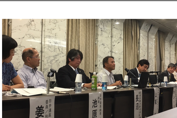
Japanese lawyers discussing the UN Principles on Arbitrary Detention at a symposium held at the headquarters of Japan's national bar association (Japan Federation of Bar Associations) on June 4, 2019.

United Nations bodies have repeatedly chastised Japan for its coercive police interrogations, insisting that the country should stop lengthy pretrial detentions, should allow attorneys to be present during interrogations and should take other steps to ensure that the presumption of innocence is respected. For example, in 2008 the United Nations Human Rights Committee wrote “The State party should adopt legislation prescribing strict time limits for the interrogation of suspects and sanctions for non-compliance, ensure the systematic use of video recording devices during the entire duration of interrogations and guarantee the right of all suspects to have counsel present during interrogations, with a view to preventing false confessions.” The Committee repeated these complaints in 2014. An entirely separate body, the UN Committee Against Torture has written that Japan’s practice of prolonged detention “coupled with insufficient procedural guarantees for the detention and interrogations of detainees, increases the possibilities of abuse of their rights, and may lead to a de facto failure to