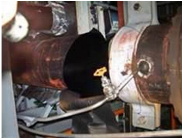
Pipes at aging Mihama reactor ruptured, releasing steam that killed four and injured seven in 2004

Second, having muddied the waters on energy policy, the Cabinet then shifted responsibility for any future reactor restarts to the new Nuclear Regulatory Authority and reactor hosting communities. The head of the NRA initially demurred, stating that his organization merely assesses operational safety and does not have responsibility for reactor restarts. He later recanted, but pointed out that utilities also share responsibility for reactor restarts because they have to get local communities to agree. But who, in what communities, gets to decide? Now that the NRA widened the designated evacuation zone around nuclear plants to 30 km, the towns near reactors also want more say in restarts since they bear the same risks, but don't receive the subsidies given to reactor hosting communities. Because lines of responsibility and authority are now dispersed and blurred, it is not clear where the buck stops, a strategy for undermining opposition.