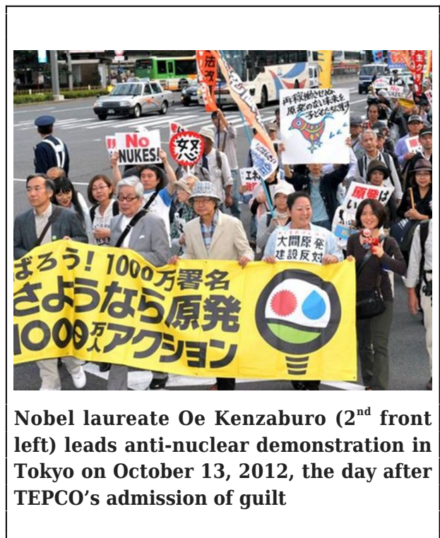
Nobel laureate Oe Kenzaburo (2 nd front left) leads anti-nuclear demonstration in Tokyo on October 13, 2012, the day after TEPCO’s admission of guilt

investigations assert that the meltdowns were preventable and refuted Tokyo Electric Power Company’s (TEPCO) claim that the massive tsunami was an inconceivable black swan event that caused the three meltdowns and hydrogen explosions. Finally, on October 12, 2012 TEPCO abandoned its tsunami defense and acknowledged that the nuclear accident was caused by its excessively optimistic risk assessments, shortchanging of safety and training, and failure to adopt appropriate countermeasures.