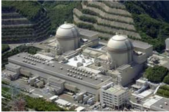
The Oi reactors may be sited on an active fault-line