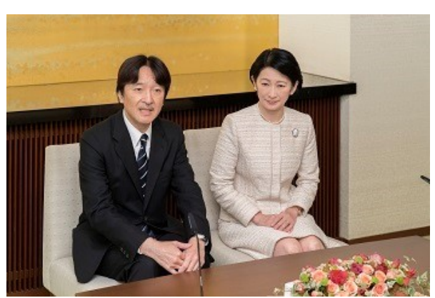
Prince Akishino no Miya Fumihito 秋篠宮文仁 with the Princess at his birthday press conference, November 2018 32

Emperor Akihito's daijōsai , the first in the postwar era, took place on the night of 22-23 November 1990. It had the distinction of being the first ever to cause legal controversy. The controversy and its resolution deserve to be more widely known. Articles 20 and 89 of the Constitution provide for the separation of state and religion. And yet, the state funded the daijōsai , which is "religious" to the extent that it features the Sun Goddess. The government fended off accusations of unconstitutionality by citing the "object and effect" principle established in a landmark Supreme Court ruling in 1977. 30 The essence of the ruling was that the state may engage with religion, so long as neither the "object" nor the "effect" of its engagement amounts to the promotion of any specific religion. The government's position was that public funding of the daijōsai contravened neither criterion. Many citizens' groups disagreed, and took legal action, but their suits all foundered on the "object and effect" principle. 31