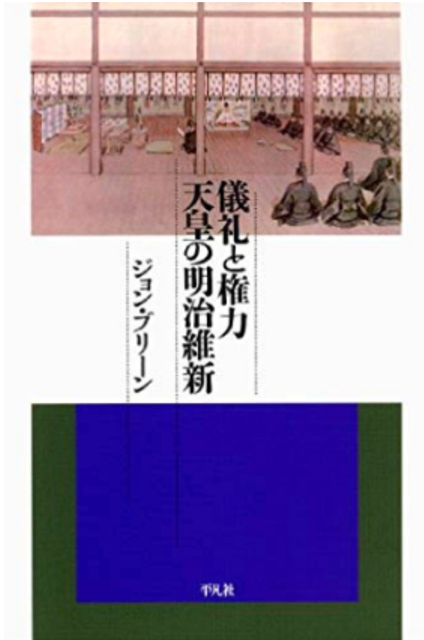
Girei to kenryoku: Tennō no Meiji Ishin 儀礼と権力 天皇の明治維新 Heibonsha, 2011.