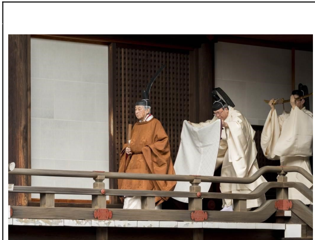
Emperor Akihito enters the kashikodokoro shrine in the imperial palace to report his abdication to the Sun Goddess, 12 March 2019 20

imperial ancestors (the spirits, that is, of all deceased emperors since the time of the mythical Emperor Jinmu), and by a shrine for the myriad gods of heaven and earth (the shinden 神殿). It is worth noting in passing that the rites which Akihito and his father before him performed at the shrine-complex since 1945 are precisely those of prewar Japan; they differ only in that they are private, and no longer public, events.