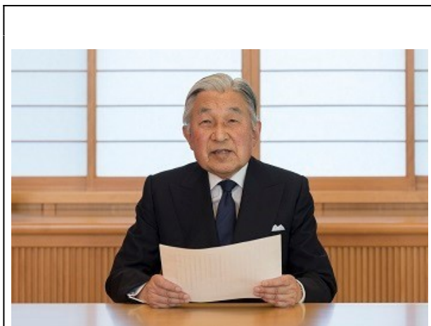
Emperor Akihito delivering his address to the nation on NHK, 8 August 2016 3

The emperor began by framing his reign as a personal search for meaning. He had dutifully carried out the “acts of the emperor in matters of state” as stipulated in Article 7 of the Constitution. These include convocation of the Diet, dissolution of the House of Representatives, attestation of ministerial appointments, awarding of honors, and so on. However, he had “spent [his] days searching for and contemplating on” the meaning of Article 1’s designation of him as “symbol of the State and of the unity of the people.” The Constitution, after all, fails to elucidate what action is required of, or indeed permitted to, a “symbol of the State.” The emperor’s search led him to conclude that he must serve as “an active and inherent part of society, responding to the expectations of the people.”