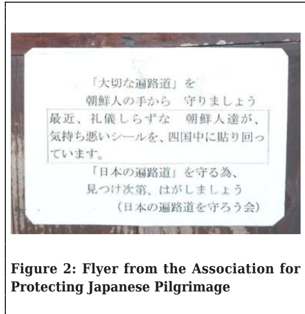
Figure 2: Flyer from the Association for Protecting Japanese Pilgrimage

stickers all around Shikoku. In order to protect Japan’s pilgrimage route, please take them down as soon as you encounter one.” (my translation)