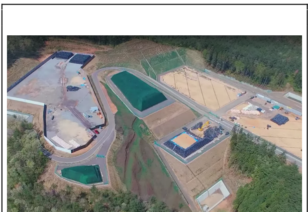
Aerial view of temporary storage site for flexible container bags containing soil from decontamination. Hōrai District, Fukushima City, April 2018.

have been recklessly opened for return of evacuated citizens despite worrisome conditions prevailing over wide swaths of the region. The J-Village soccer center, which had served as a base for disaster workers, where they slept, donned protective gear, and were screened, are scheduled to become the training site for the national soccer team, with hopes that others might follow suit. It has even been proposed as the starting point for the Olympic torch relay. One baseball and six softball games are to be held in Fukushima City.