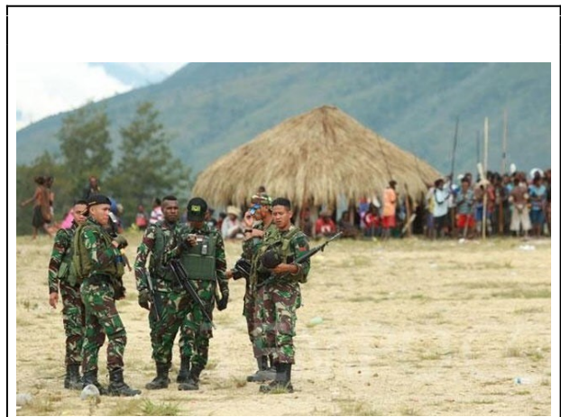
TNI troops in Nduga in January 2019, with a Papuan hut (honai) and local community in the background.