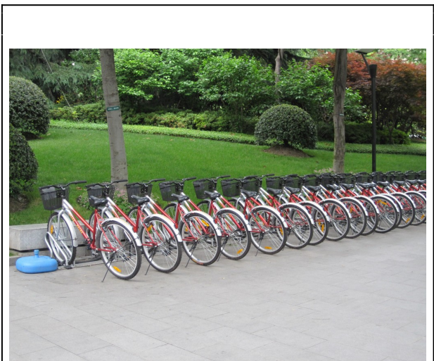
The greening of the city

Huiliang's commentary highlights both the benefits and the potential conflicts surrounding