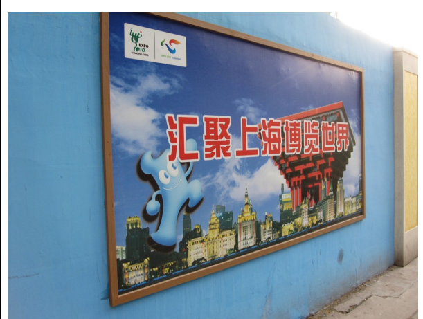
Expo advertising hiding urban “unsightliness.” The caption reads “Bringing the world together at the Shanghai Expo”

While some old neighborhoods were razed to accommodate the Expo and remove unsightly shantytowns, others were demolished to erect upscale residential apartments and fashionable shopping venues that, by global norms of modernity, improved the visual schema of the built environment. Those that remained standing were whitewashed or surrounded with opaque fencing decorated with Expo advertising and scenes of absent greenery.