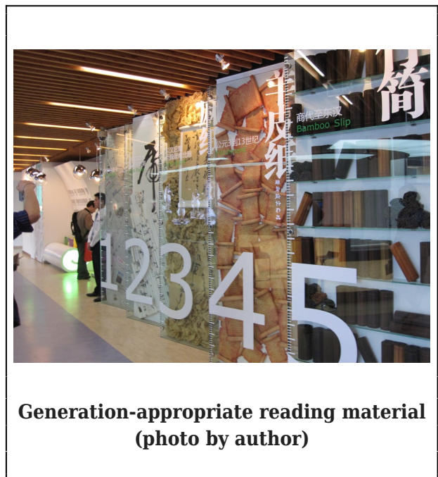
Generation-appropriate reading material

cultural habits of each of the generations. Reflecting these different age groups, the first floor was labeled the “youth apartment” and included a “reading room” that featured a wall of various forms of reading material behind plexiglass (from parchment scrolls to books) and a pillowed nook area set against a backdrop of dozens of e-readers hung on the wall, presumably for the technologically savvy younger generation. Designers devoted another level of the house explicitly to the grandparent generation with rooms labeled “elderly kitchen,” “elderly parlor,” “elderly toilet,” “elderly bedroom,” and “elderly lounge.” One of these rooms associated age with tradition through a full-wall, classic-style painting of pagodas set in a lush landscape that depicted historical Shanghai. The bedroom and lounge similarly juxtaposed new and old with Philips flat-screen televisions situated over intricately carved wooden daybeds and laptops resting on traditional desks.