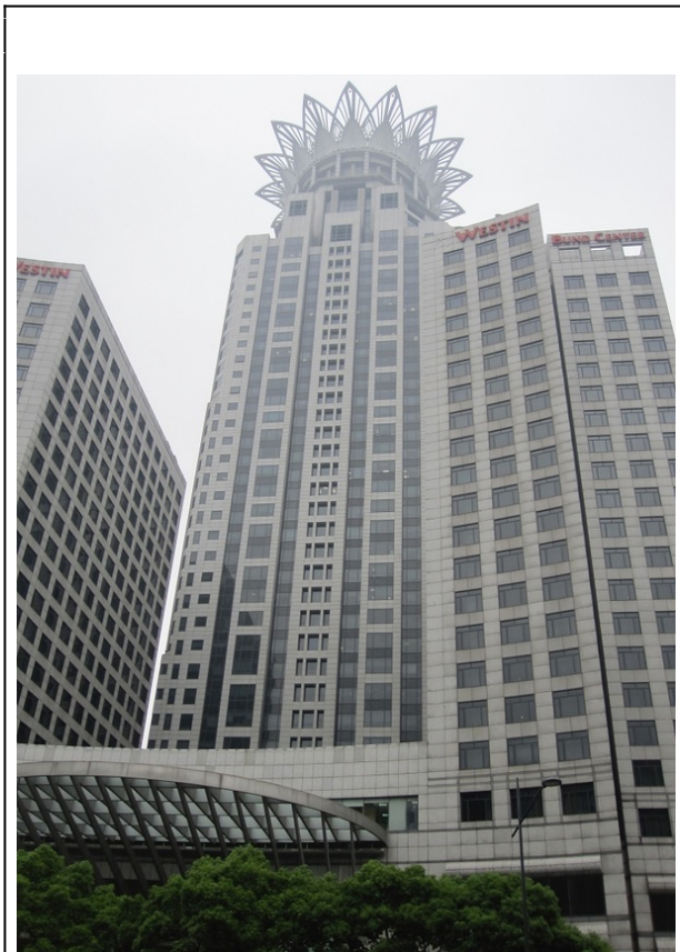
Heavy pollution in Shanghai during the Expo

the development of a world-model metropolis for the Expo. While his assessment recognizes the Expo's efforts to model best practices for urban living, it also reveals possibilities for disengagement from state improvement schemes and hence potentially from certainties about state legitimacy. The daily encounters that mediate the changes in urban space (200 kilometers of subway for example) are often material—the construction noise and dust that “have [the] negative effects” of which Huiliang speaks—but also conceptual, and thus, while they might suggest a certain kind of urban modernity, they also might not “bring Shanghai anything practical” or prove worth the disruption they entailed.