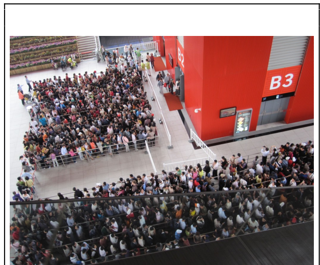
Typical lines for the China Pavilion

modes of passage linked Shanghai proper to the sleepy agricultural district of Pudong, which was hosting a glorious, universal exhibition. Exactly one hundred years later, Pudong had become not only the core of contemporary Shanghai’s financial and commercial activity but also the site of the 2010 Shanghai Expo, a universal exhibition—like that imagined in New China —that presented its host city as the epitome of global urbanity: Lu Shi’e’s science fiction had become Shanghai reality. As Shiloh Krupar has noted, “conjoin[ing] Shanghai’s renaissance to the revival of the contemporary world Expo format” thus appeared to fulfill “Shanghai’s destiny as a global city” (2016: 2; see also Winter 2012).