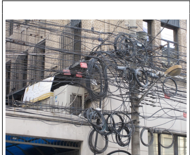
Infrastructural overload in Shanghai

roadways that accompany China’s position as the world’s largest emitters of greenhouse gases (Economy 2004; Kahn and Yardley 2007; Tilt 2009).