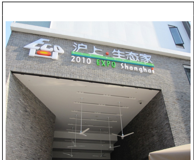
Entrance to the Shanghai Eco-house

The Shanghai Eco-house, promoted as a model for modern family living, was a four-story