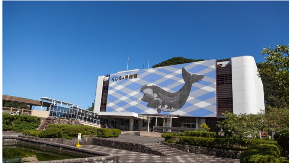
The Taiji Whale Museum.

To say that Japanese whaling has been controversial during the past three decades would be an understatement, but how have international and domestic anti-whaling movements played into the recent decision of the Japanese government to withdraw from the IWC? To answer this question, let us start with Taiji, the only whaling community widely known outside of Japan. Overlooking the picturesque Kii peninsula coastline, Taiji is perfectly located to watch migrating whales swimming along the Japanese coast. Its whaling history reaches as far back as 1606, when the first whaling group was established to hunt right whales ( Eubalaena japonica ).