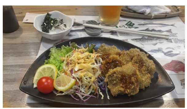
Fried whale meat dish in Kushiro.

Our visit to the last “whaling town” brings us to the icy coast of the Okhotsk Sea in northeastern Hokkaido. In the summer, several whale species travel thousands of miles along the Japanese Pacific coast to reach these waters and feed on plankton and small fish. Long before the first Japanese or even Ainu reached this northern region, the indigenous Okhotsk people hunted whales here. Visitors to Abashiri, a fishing city of around 35,000 inhabitants, come mostly to sightsee at the prison museum, which preserves the original buildings of Japan’s most infamous prison from the Meiji period, or watch the drift ice. Unlike the other whaling communities, walking through the city streets gives little indication that this city has a deeper connection to whales: there are no restaurants praising whale meat and no manholes with whale motifs. Only when reaching the harbor do you find whale posters, but these whales are not for eating. Instead, these posters are for the newest tourist attraction: whale watching.