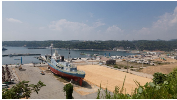
Ayukawa after the Tsunami.