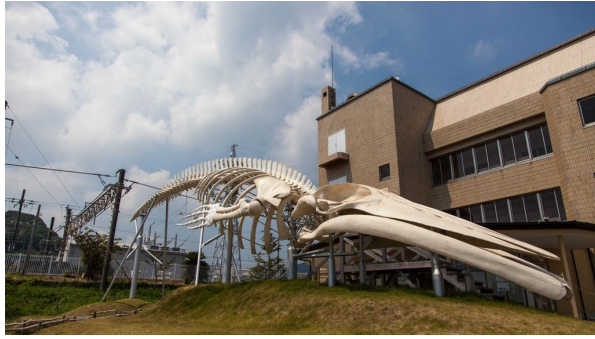
Blue whale skeleton in Wadoura.

Taiji highlights how regional politics and culture have played a crucial role in resuming commercial whaling, but why did the government end whaling operations in the Antarctic Ocean and what does this change mean for current coastal whaling operations? To find the answers to these questions, let us travel to the Kanto region and the “whaling town” of Wadoura.