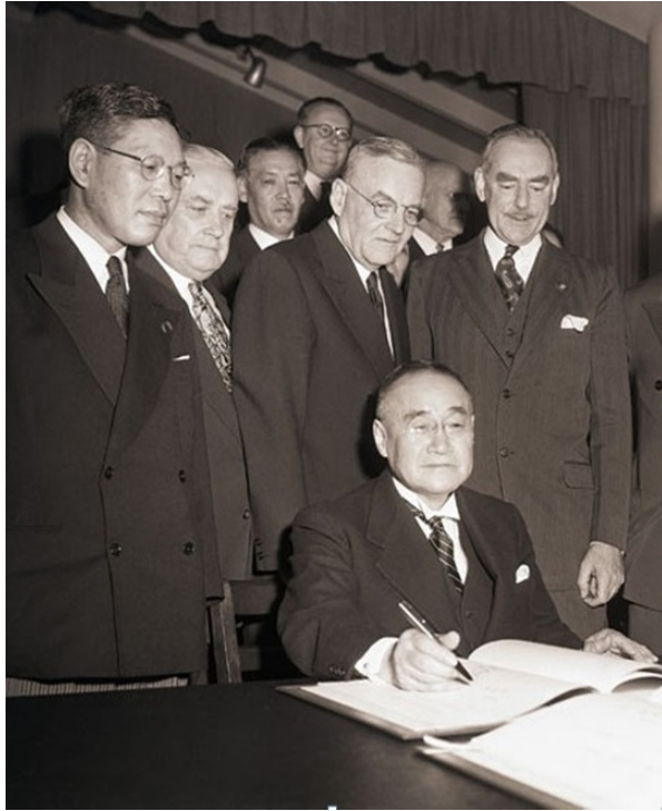
Japanese Prime Minister Yoshida Shigeru signs the San Francisco Treaty as John Foster Dulles (center) and Dean Acheson (right) look on.

The San Francisco Treaty together with the US-Japan Security Treaty signed later that same day served to establish the US camp for continuing the Korean War and defining Japan's position in it. We can call this the San Francisco System. In sum, the San Francisco System is an international state system that did not terminate a war but instead continued one: the Korean War. The enemy camp of the San Francisco System consisted of North Korea and the People's Republic of China, and, implicitly, the former Soviet Union. The vanguard of the US camp consisted of the US forces in Korea, South Korean troops, and Chinese Nationalist soldiers based in Taiwan. American headquarters and the main strategic and logistic bases were in Japan and Okinawa (the latter still fully under American occupation