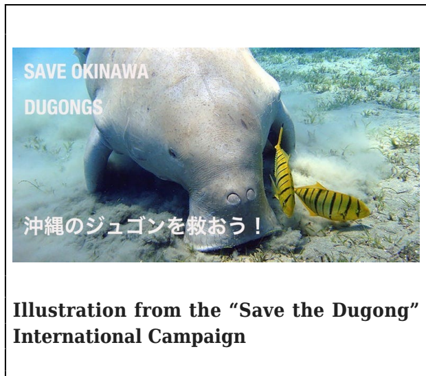
Illustration from the “Save the Dugong” International Campaign

protection suits in US history. The court is considering a US/Japan NGO appeal in the name of the dugong, in the case that began as “Dugong vs Donald Rumsfeld” against a Californian court’s August 2018 ruling in favour of the government’s construction plans. The NGOs insist that the government’s withholding of crucial environmental information (especially the sea-bottom mayonnaise) should make its conclusion that the endangered adugong would not suffer “adverse effects” from construction improper and unwarranted. 41