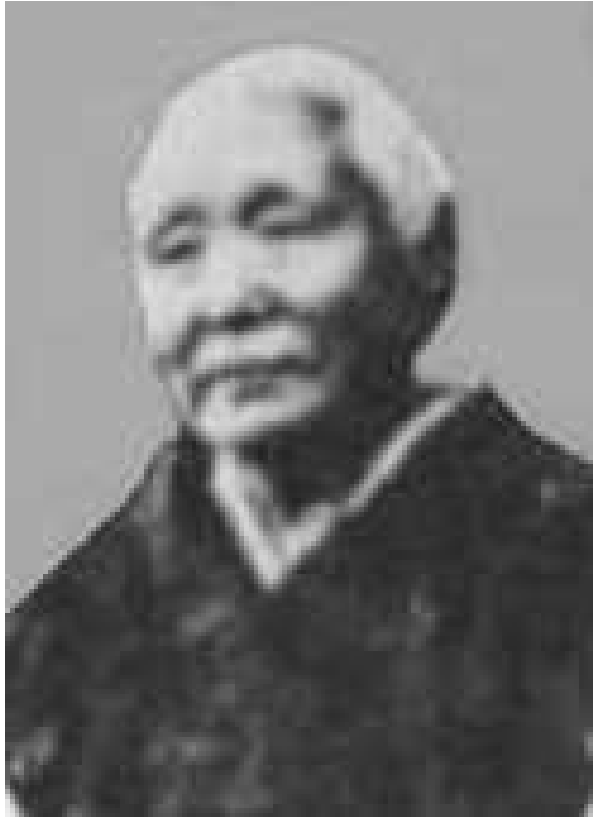
Figure 3: Kataoka Sada, photograph from 信仰の礎 : 浦上公教徒流配六十年記念, a book produced in 1930, representing sixty years after the Fourth Persecution, Urakami Cathedral. Public domain.