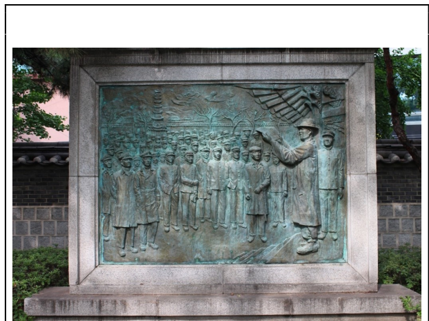
Bronze relief in T’apkol Park depicting the public reading of the Declaration of Independence on 1 March, 1919, Seoul

Approximately 3,000 copies of the declaration were distributed throughout Seoul that morning. In response, tens of thousands of Korean citizens from all walks of life poured into the streets waving the Korean flag, singing the national anthem, and shouting Taehan Tongnip Mansei (Long live Korean independence)! At two o’clock, the protestors gathered at T’apkol Kongwŏn (T’apkol Park, formerly Pagoda Park) to hear the declaration read publicly by the independence activist Son Pyŏng-hŭi 孫秉熙 (1861 - 1922). 23 It advocated non-violent demonstrations that would appeal to the international community for assistance in Korea’s bid to reclaim its freedom. 24