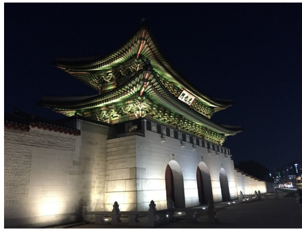
The reconstructed Kwanghwamun Gate, Seoul

be destroyed in the Korean War (1950-1953). 52