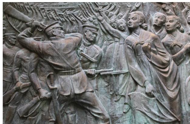
Bronze reliefs (details) depicting the Japanese response to Korean protestors

Meanwhile, in Taishō (1912-1926) Japan, the Sam-il Movement prompted many Japanese to scrutinize Korea's place in the empire for the first time since the 1910 annexation. As polarized opinions about the empire's actions in