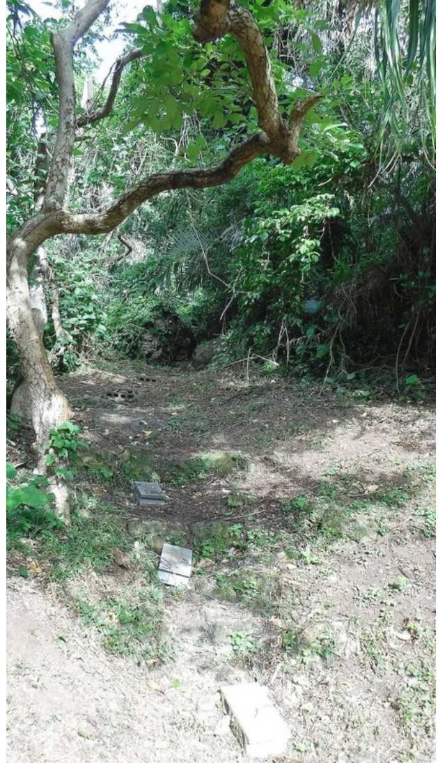
Path to the tomb of Shō Hashi in Yomitan

Shō Kinpuku's 尚金福 (r. 1450-1453) tomb is in Urasoe 浦添, north of Naha [C], but the remains of his younger brother, Shō Furi 尚布里 (dates uncertain) are in Fusato 富里 [D] near the Chinen Peninsula in southeast Okinawa. Shō Furi went to war with Kinpuku's son, Shō Shiro 尚志魯 (d. 1453 or 1454). This uncle-nephew war resulted in the destruction by fire of much of Shuri castle and the deaths of both parties, at least according to the official story. Archaeological evidence confirms severe castle damage, but the details of who was at war with whom and what exactly happened are