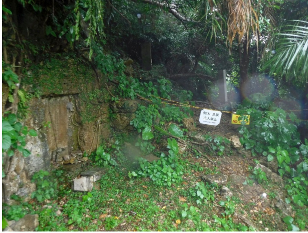
The tomb of Oni-Ōgusuku lies beyond the sign warning of falling tree danger

1445-1449) are buried far away in Yomitan 読谷 [B] in central Okinawa.