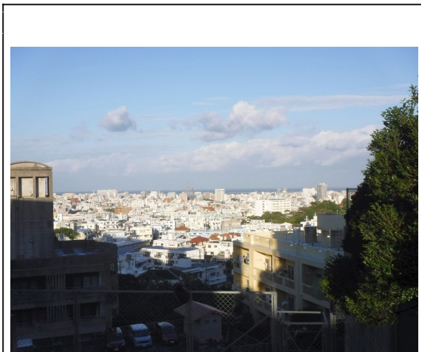
View of Naha from near the tomb of Shō Toku

Taikyū was almost certainly born in Goeku 越来 in central Okinawa, a son of the local warlord, and initially he was entombed in that area. However, his bones were moved several times, and in 1910 ended up far away, in Fusato [E] near Furi's tomb. Taikyū's daughter Momoto-fumiagari 百十踏揚 (d. ca. 1469-70), acclaimed in Omoro songs as a potent shamanic dancer, resides slightly north of Fusato, in Tamagusuku [F]. However, the remains of her husband, the powerful warrior Oni-Ōgusuku 鬼大城 (d. ca. 1469) are at Chibana Castle 知花城 [G] in the Goegku area, the homeland of Shō Taikyū. The last king of the dynasty, Shō Toku 尚徳 (r. 1461-1469), is portrayed in the official histories as both evil and fond of warfare. Such is the reputation of last kings in Confucian histories. His tomb is in the Uema 上間 district [H] on the outskirts of Naha, commanding a splendid view of the city below.