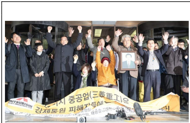
The South Korean Supreme Court upheld the verdict requiring Mitsubishi Heavy Industries to compensate Korean forced laborers