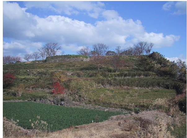
Remains of Hara Castle.

This uprising ended with the killing of some 37,000 Japanese—mostly Catholic peasants—in one day, when the Rebellion was finally crushed by government forces. The novel is based around the story of the historical figure Amakusa Shirō (1621-1638), a charismatic youth who at the age of fifteen became the leader of the Rebellion. It deals not only with religious persecution, but also with a wide range of economic and social issues, including the exorbitant taxes levied on peasants by the central government. The events occurred nearly 400 years ago when Japan was looking outward and experimenting with international trade, new religions, and cultures. Ishimure spent fifty years writing Hara Castle . A monumental work of 530 pages in Japanese, it has been considered by many to be Ishimure’s most important work.