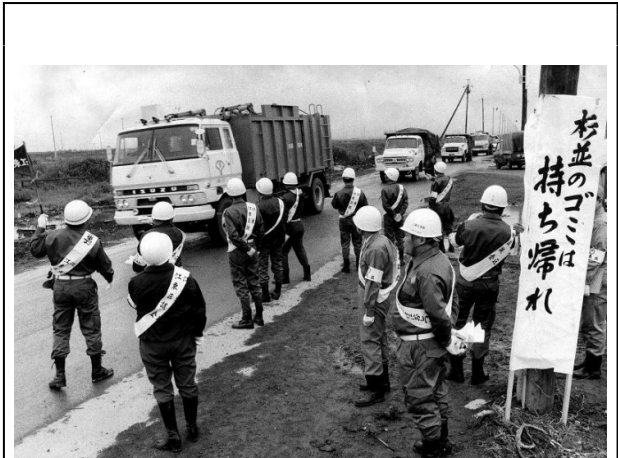
The sign reads, "Take Back Sugunami's Garbage." May 23, 1973.