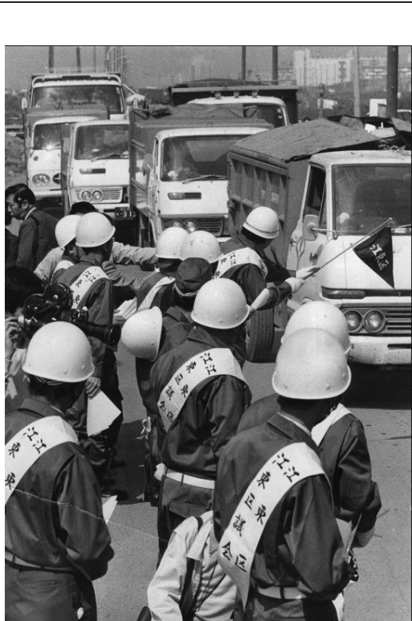
Members of the Kōtō ward assembly checking garbage trucks entering their ward for those carrying rubbish from Sugunami ward. May 22, 1973.

opened their newspapers and turned on their televisions to witness members of the Kōtō ward assembly in helmets, physically barring entrance to Landfill Number Fifteen. And for at least the few days when collection was suspended, denizens of Sugunami ward encountered piles of garbage spreading across their sidewalks. 10 The presence of rubbish, made inescapable by Kōtō's actions, helped force an intervention by Minobe, who persuaded Kōtō to end its blockade and resumed negotiations with a Sugunami ward more committed to figuring out a site for construction of its incinerator. 11