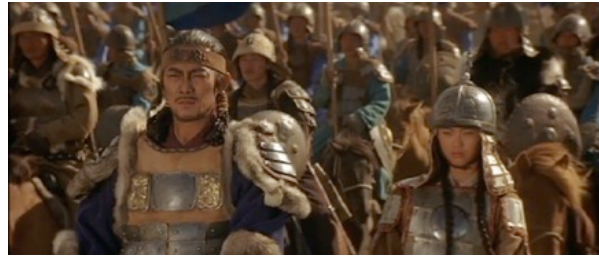
Fig. 6. Chinggis Khan and Khulan ride together into battle in The Blue Wolf: From the End of the Earth and Sea (2007).