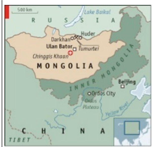
Fig. 7. Map of the country of Mongolia and Inner Mongolia, autonomous region of the People’s Republic of China ( The Economist ).

Mongolia itself had become divided in 1911, with the Northern part of Mongolia or Outer Mongolia breaking away from China and maintaining an autonomous state for eight years under the Buddhist lama Bogd Khan, 75 while the Southern part of Mongolia or Inner Mongolia remained under Chinese sovereignty.