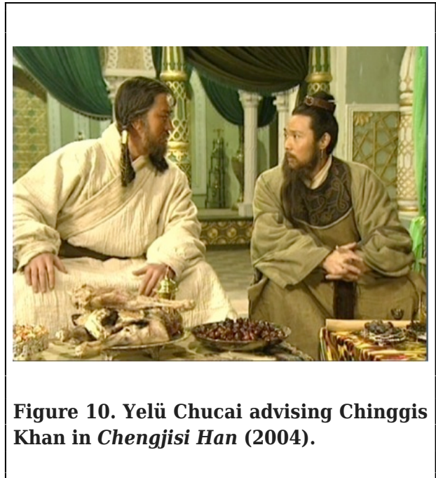
Figure 10. Yelü Chucai advising Chinggis Khan in Chengjisi Han (2004).

Daoist sage. 109 These men imbue in Temüjin an appreciation for the value of learning and scholarship for administering an empire, with particular attention to the three great teachings of China: Confucianism, Buddhism, and Daoism.