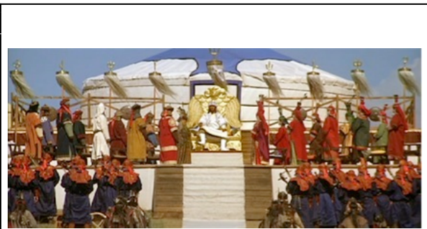
Figure 5. Coronation of Chinggis Khan in 1206, as recreated in The Blue Wolf: To the Ends of the Land and Sea (2007).

Army soldiers, along with local support staff, and they made up the main form of Mongolian participation. 55 It is fair to say that The Blue Wolf is more representative of Japanese fascination with Chinggis Khan and of a Japanese re-imagining of his life story, than of a Mongol perspective.