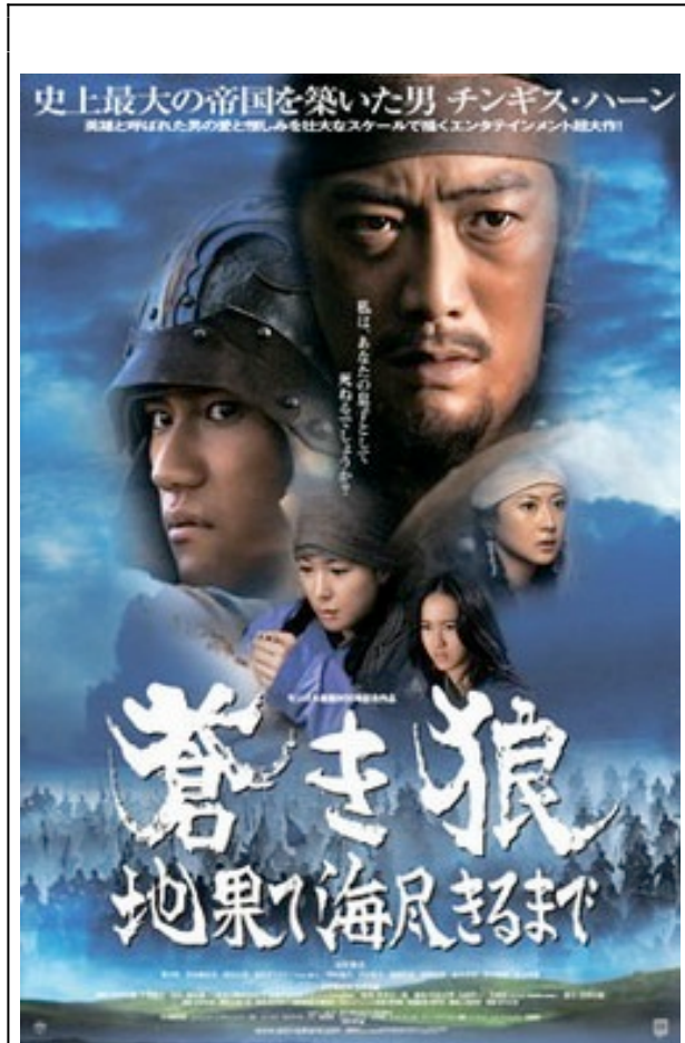
Figure 4. The Blue Wolf: From the End of the Earth and Sea (directed by Sawa Shinichirō, 2007).

While The Blue Wolf was billed as a Japan-Mongolia co-production shot on location in Mongolia over a four-month period in 2006, Mongolians were no happier with it than they were with Bodrov's Mongol . The Blue Wolf was the personal project of co-producer Kadokawa Haruki, a publisher and film director who had conceived of a movie project on Chinggis Khan 27 years before it finally came to fruition.