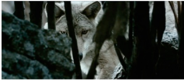
Figure 3. The Blue Wolf, the mythical progenitor of the Mongols used by Bodrov to represent Tenggeri, responds to Temüjin's Prayer in Mongol (2007).