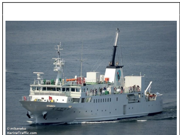
The Etopirika, which is used for visa-free visits to and from the Southern Kurils/Northern Territories.

the former residents and their relatives to visit the islands. The existing system, which has operated since 1992, enables relevant Japanese citizens to visit the islands without the need of a visa, which would acknowledge Russian authority. To make the system reciprocal, Russians now living on the islands are permitted to visit Japan under the same conditions. These annual summer visits are conducted using the Etopirika, a Japanese passenger ship that is based at Nemuro, the closest Hokkaidō port to the disputed islands. These trips can be very time-consuming, not least because it has been the practice for all entry procedures to be conducted at sea at a point near Kunashir/i. This means that, even when traveling to one of the other islands, all visitors must go by way of Kunashir/i, in some cases adding six hours to the journey time (TASS 2017). Additionally, even during the summer months, the weather conditions and visibility in the area can often be poor. These factors mean that it is increasingly difficult for former residents, whose average age is over 80, to make the trip.