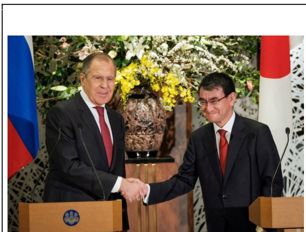
Foreign Minister Kōno Tarō hosts Russian counterpart Sergei Lavrov in Tokyo on 21 March 2018.

and signed a cooperation agreement between the LDP and United Russia Party ( Mainichi 2018b; RIA Novosti 2018). At the same time, Sekō Hiroshige, who is Minister of Economy, Trade and Industry, as well as Minister for Economic Cooperation with Russia, was in Moscow to meet First Deputy Prime Minister Igor Shuvalov. The purpose of these talks was to ensure that meaningful economic agreements would be ready for announcement at the St Petersburg International Economic Forum on 25 May.