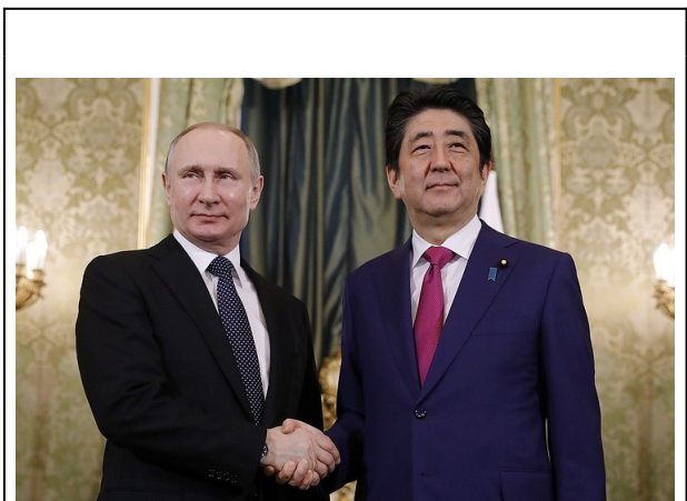
A breakthrough remains unlikely when

It is impossible to entirely rule out a surprise outcome at the May summit. In particular, the Russian side may judge it expedient to permit Japan to make some gains. This would give Abe something to sell domestically, thereby raising the chances of his pro-Russian policy continuing. However, given the legal obstacles and the fact that Abe is unlikely to agree to an extensive visa-free zone, the most likely result is a summit that delivers little beyond a few symbolic images, some vague economic promises, and an agreement to continue working on the joint economic activities. This is an outcome that is largely satisfactory to the Russian side since they remain in control of the islands and they gain a certain international legitimation by Abe's diplomatic efforts. By drawing out the dispute for as long as possible, the Russian leadership also ensures that Japan will continue to have reasons to court Russia through promises of economic cooperation and by distancing itself from Western policy designed to isolate Russia. This lack of urgency can be observed in the comments of Deputy Foreign Minister Igor Morgulov who stated at the start of May that "Real progress in resolving this issue is possible in the context of the comprehensive development of Russia-Japan ties, and the formation of an atmosphere of genuine mutual trust and partnership. We are only at the very beginning of this process." (Izvestiya 2018).