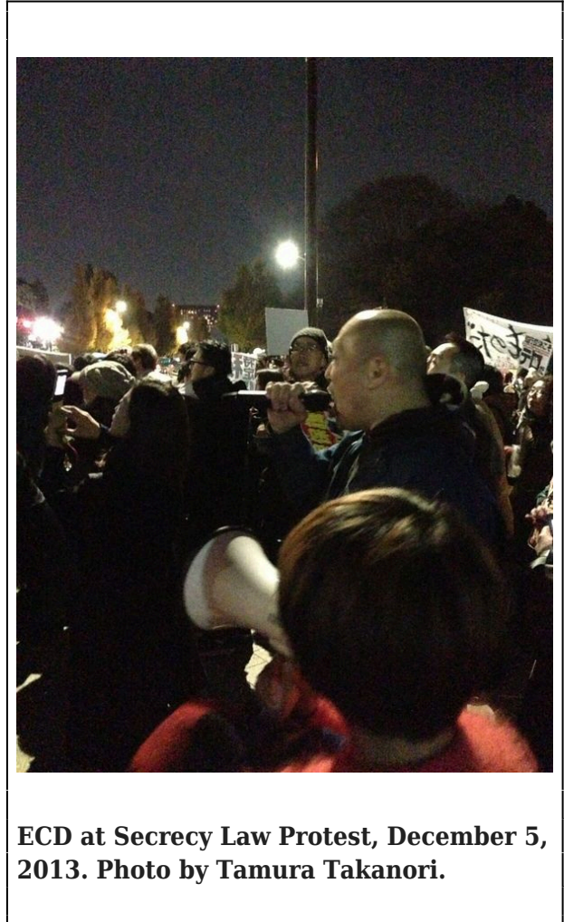
ECD at Secrecy Law Protest, December 5, 2013.

ECD was a constant presence in the many protests that took place over the two weeks prior to passage, including a 10,000-person rally in Hibiya on November 21, and a hastily organized protest in Ōmiya, Saitama , the site of the only public hearing of the law, on December 4 . On the evening of the vote, 15,000 protesters assembled in Hibiya Park, and 40,000 gathered in front of the Diet , where ECD led some calls .