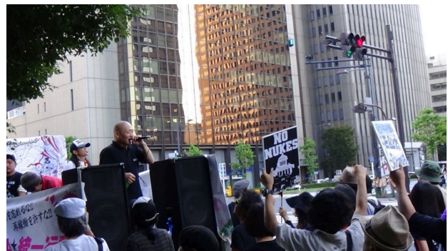
ECD, ATS, and Noma, antinuclear demonstration, Tokyo, October 13, 2013.