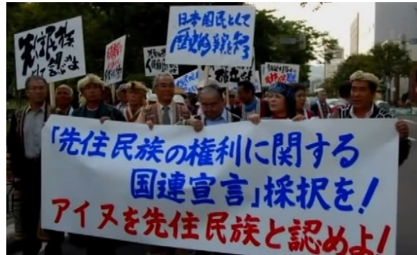
Demonstrators call for official recognition of the Ainu's rights as indigenous peoples.

But in these cases, Ainu policy as construed in terms of the constitution depends not upon clear stipulations found in the actual constitution itself, but rather on the interpretations of a handful of constitutional scholars. Moreover, Article 13 of the constitution clearly deals with the human rights of individuals (not of groups), and does so only to the extent that this “does not interfere with the public welfare”. In other words, while the criteria of the United Nations Declaration on the Rights of Indigenous Peoples emphasizes the centrality of collective rights, Ainu policy falls at the exact opposite end of the spectrum: it is presented as a matter of the rights of individuals to “life, liberty, and the pursuit of happiness”. Tsunemoto came to refer to this unique rights policy in 2010 as “Japanese-style Indigenous Peoples’ Policy” 25 . Not surprisingly, this idea has become an extremely effective back-up for the Japanese government, particularly for central government bureaucrats who are reluctant to support group rights.