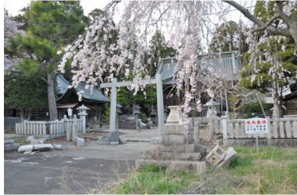
Odaka-Shrine--deformed by the earthquake

April is a symbolic month in Japan because thousands of students enter new schools. Some public schools in the city that were closed amidst fears of high radiation are now able to reopen, based on the results of the local governmental reports on decontamination.