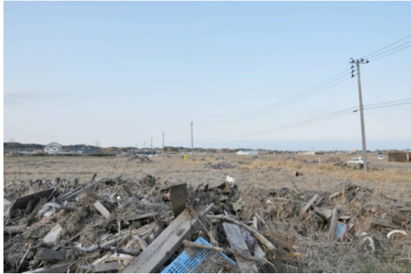
Odaka under mountains of debris one year after the earthquake

In many places, water is leaking as the tsunami and earthquake shifted the ground. Debris from the disaster is scattered everywhere, and houses, shrines and infrastructure are badly damaged. By contrast, the cherry trees were in full bloom as if nothing was wrong, regardless of the chaos caused by contamination and radiation.