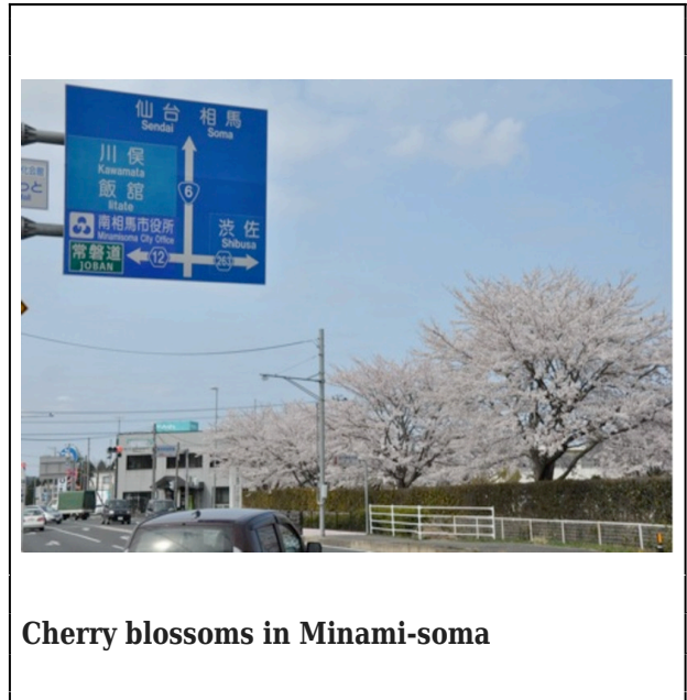
Cherry blossoms in Minami-soma

Even if it were safe, Odaka has other problems: “There is no reconstruction of public facilities and infrastructure, and I wonder how we can make a living there.” There is also growing anxiety over the compensation process among evacuees inside the newly liberated zone. Does this mean that compensation is going to be halted, as many fear?