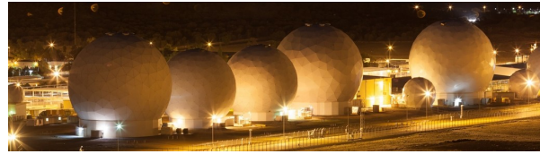
Antennas of Pine Gap

A similar set of defense doctrine contradictions was embodied in the protracted and intense intra-government debate about replacing an ageing small submarine fleet. This was eventually resolved in 2016 with the decision to commit $39 billion to build 12 4,000 tonne conventional diesel-electric submarines based on a DCNS-Thales design derived from the French Barracuda -class nuclear submarine. Once again, doctrinal concerns for a submarine capability designed for defense of the continental sea/air gap and archipelagic Southeast Asian areas of direct strategic interest to Australia appeared to be trumped by advocacy rooted in alliance concerns for capacity to conduct very long-range coalition-support operations centering on a blockade of Chinese waters - a choice with considerable consequences for design requirements and for the Australian strategic relationship with China.