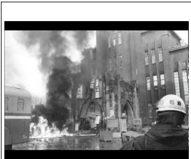
Yasuda Hall, the University of Tokyo, under siege in 1969.

Despite the great variety of events that were eventually encompassed in popular understanding of the symbolic events of "1968" underlying all of them were the powerful visual images disseminated through new media, above all TV, that spread rapidly throughout society in Japan and many other countries in the 1960s.