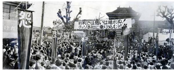
Minamata victims and supporters demonstrate demanding compensation

Small groups could gain wide influence if they received TV coverage. This encouraged the movements to focus on visual images. In January 1969, when police and students fought at the University of Tokyo, new left groups raised their flags above Yasuda Hall inviting TV coverage. 15 In November 1970, when Minamata disease victims marched in protest at abuse by the Chisso Corporation, they raised black flags with the Chinese character "anger (怒, "On")" in both an expression of fury at their treatment and a powerful bid to be televised and photographed.