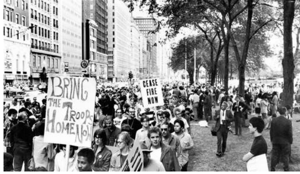
Anti-Vietnam War demonstrators in Chicago 1968

Activists were quick to grasp the possibilities of television coverage. Todd Gitlin titled his book on mass media and the new left in the United States "The whole world is watching," referencing a comment by demonstrators in Chicago in 1968 and picked up and chanted by activists everywhere. 12 Japanese activists were also conscious of the media. For example, Japan's new left groups wore colorfully painted helmets. According to the recollection of a veteran activist, when he asked young activists in his group why they painted their helmets red during 1967 demonstrations, their reply was "red is a good color for television." 13