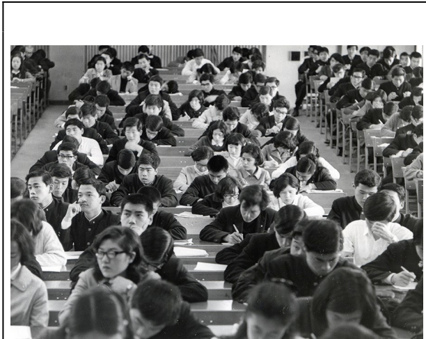
Class in Auditorium in the 1960s

increases and various university administrative policies. Many student activists at the time wrote that intense entrance examination competition and poor quality education first led them to become aware of social issues. 19