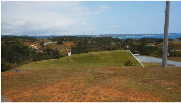
Storage area with fortified underground igloos that contained nuclear weapons before reversion (2014 photograph)

government paid for the removal of nuclear weapons from Okinawa are the first and only time the U.S. government has acknowledged their presence. 4 Since they were removed, the Marines have used the base to store conventional (non-nuclear) ammunition. However, the nuclear weapons storage area remains intact to this day with close-cropped grass and sod-covered concrete storage igloos with steel doors.