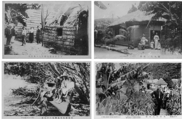
In early twentieth-century postcards, such as those shown above, the descendants of the original inhabitants are called kikajin (naturalized citizens/subjects) and gaijin (foreigners). Both terms strip them of their identity as the culturally distinct people whose ancestors established civilization on the Bonin Islands prior to the arrival of Japanese colonists.

Kikajin implies a courtesy granted by the government to an individual or individuals. For example, a foreign-born refugee holding a Japanese passport is a kikajin . More accurate terms in the Japanese language exist but have not been extended in any meaningful way to the original Bonin Islanders and their progeny, such as senjūmin (original inhabitants), genjūmin (original people), and dochakumin (people of the soil). 24 Their descendants for generations were called kikajin and gaijin (foreigners) despite being born as Japanese citizens/subjects. The first inhabitants of the Bonin Islands have never been considered first peoples by the government of Japan.