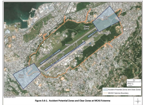
Figure 3.6-1. Accident Potential Zones and Clear Zones at MCAS Futenma

In 2003 then US Secretary of Defense Donald Rumsfeld flew over Marine Corps Air Station (MCAS) Futenma, Okinawa, looked down, and declared it to be “the most dangerous base in the world.” Of course there are many bases, including some in war zones, that could contest that honor. The question is, what did Rumsfeld see that shocked him into making this extreme statement? He saw an airstrip smack in the middle of a crowded city, with residences, parks, schools, businesses, right up to the fence.