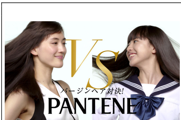
Ayase Haruka versus schoolgirl in a commercial for Pantene shampoo. © Pantene.

Ayase features in five different commercials during the pilot episode, with one ad repeated. This is Pantene 'Virgin Hair Showdown', in which the actor squares off against a schoolgirl in a battle for the shiniest hair. Positioned over an image of their juxtaposed lustrous locks, the final title card reads "Is their hair equally as shiny?" Is this a straightforward appeal to youthfulness, or virgin-birth clones in the making?