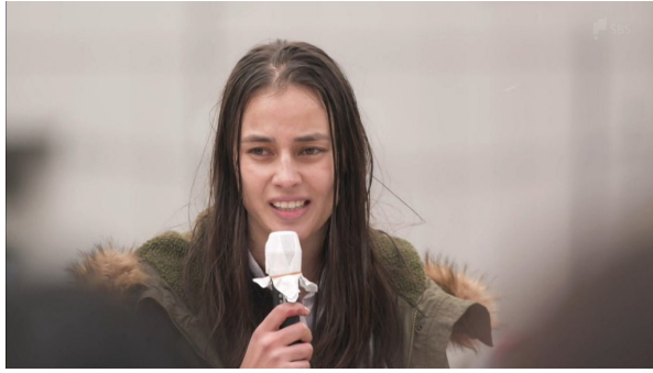
Manami gives a speech about clones' rights before committing suicide.

The first problem with this character is that it goes against Ishiguro's stated objective for his novel, namely to challenge his readers by frustrating them with a narrative method that could be termed 'asymptotic':