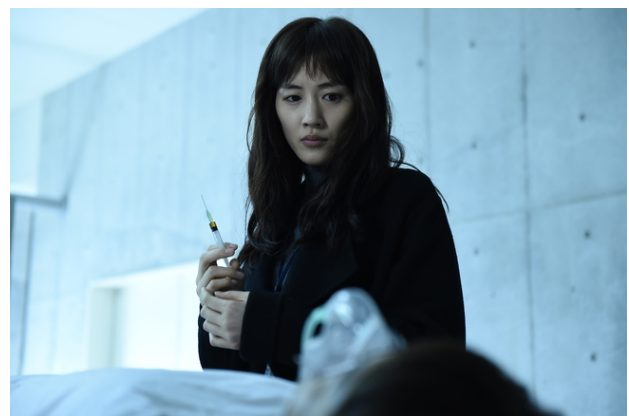
Ayase Haruka as Kyōko in Watashi o hanasanaide , about to euthanize a fellow