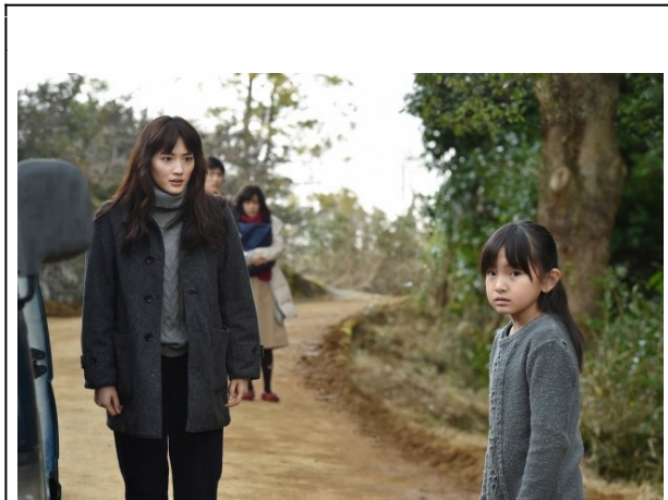
Kyōko meets a child-clone version of herself.

Never Let Me Go as his most ‘Japanese’ novel, thereby virtually giving the producers licence to mine his original work and use the Japanese setting to bring out latent elements. So what thematic deep-diving can be observed in the finished product? First of all, the central figures’ childhood is indeed fleshed out. We get a real sense of the scorn with which society views the clones in subtle touches such as the cast-off, thread-bare clothes the children wear. Far more sensationally, rumours are promulgated, as a form of social control, that the surrounding forest is home to a child killer; when two boys climb over the wall, they never return, having become forcible child donors for the sin of challenging authority. But one of their blood-dripping shoes appears on the iron gate of the school as a warning to the others.