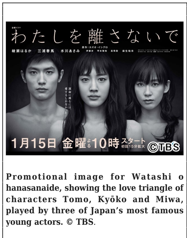
Promotional image for Watashi o hanasanaide, showing the love triangle of characters Tomo, Kyōko and Miwa, played by three of Japan’s most famous young actors.