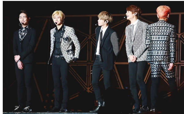
SHINee in performance in Taiwan, March 21 st , 2015 (SM Town Live World Tour IV). (l-r: Onew, Taemin, Jonghyun, Minho, Key).