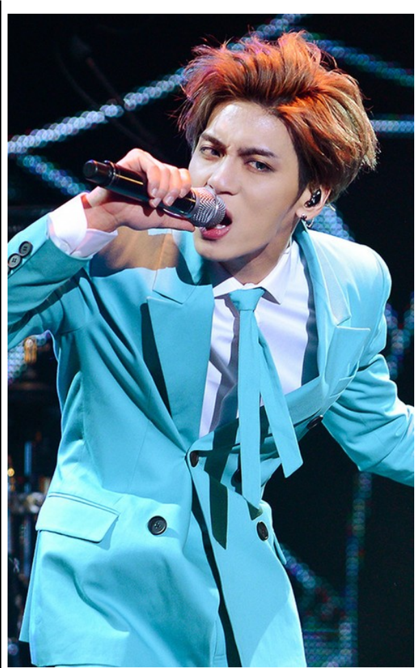
Jonghyun performing during the January 8 th , 2015 Base Showcase.

In K-pop, Bieber-esque misdeeds would virtually destroy an artist's career. 54 In the Korean media, idols' behavior can spark controversies and discussions around their "bad" attitude, which they might be accused of if, for example, they did not seem sufficiently sincere when greeting others, especially "senior" celebrities, on television programs. 55 Has an American star ever been castigated in headlines for failing to enthusiastically say hello to another star? Control over stars in this way is made possible precisely by the fact that the Korean spectators are considerably more homogenous than, for example, the North American media consumer, and generally share ideas of performed politeness. Furthermore, in Korea, there is significant inter-generational media consumption—a popular drama may achieve a 20% viewership rate—and K-pop is similarly viewed and listened to by young and old alike (albeit more passively by older generations). Outside Korea, the viewers and producers of a show like Duck Dynasty may have little overlap with the American who objects to Kendall Jenner's Pepsi ad or Roseanne Barr's tweets. Those celebrities can do things that cause vocal protests, but maintain a core fan base and find future work. However, the smaller and more tight-knit nature of the Korean media business means that once consensus turns against a star, it can be very hard to find someone willing to offer them a second chance.