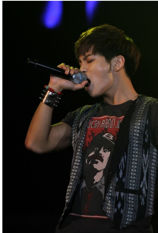
Jonghyun performs at the EXPO Arirang Pop Music Festival, July 27 th , 2012.

"Deja-bu," a solo song by Jonghyun featuring a guest appearance by Zion-T "She Is" was Jonghyun's 2016 solo hit