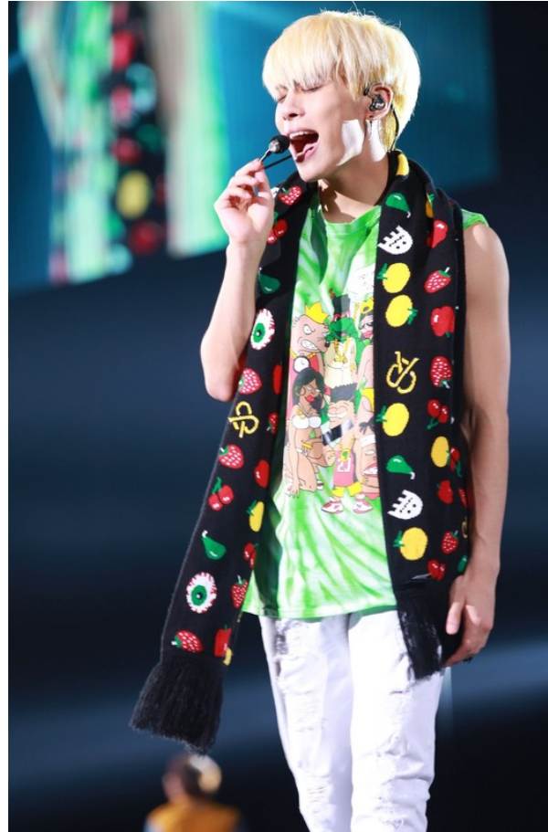
Jonghyun singing in Taiwan, May 11 th , 2014 (SHINee World Concert III).