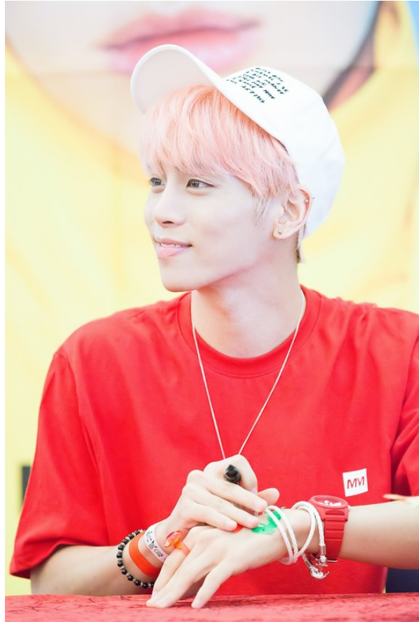
Jonghyun at a fan event in Busan, June 2016.