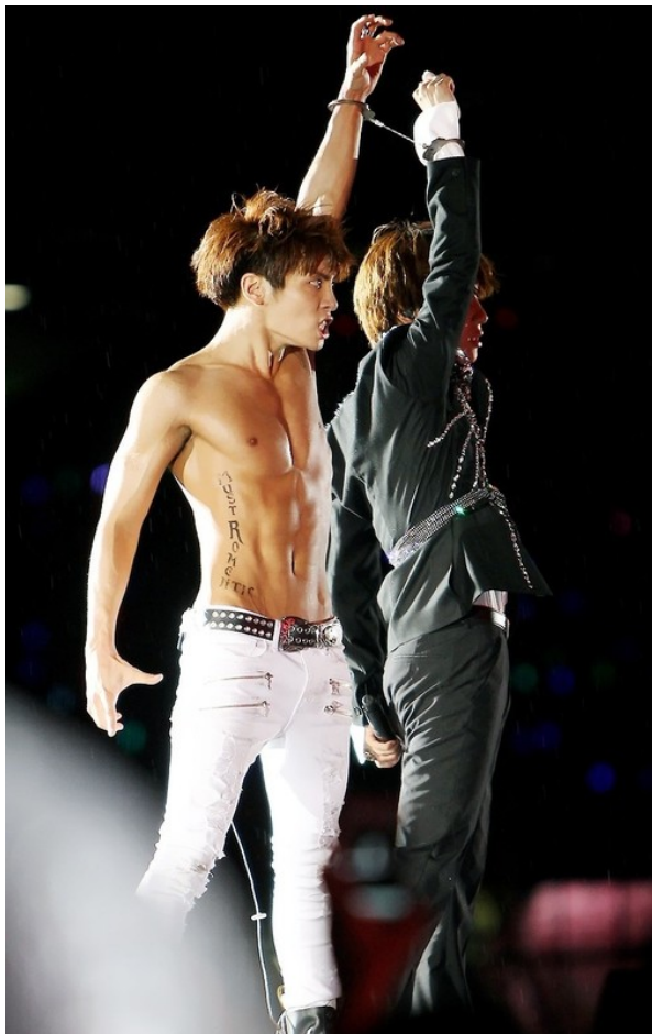
Jonghyun and Taemin performing, August 18 th, 2012 in Seoul (SM Town Live World Tour III).

Taking the wrong side on a political issue or angering audiences with unpopular opinions can be damaging as well. The clearest example of this is Yoo Seungjun, a major star at the turn of the millennium. Seungjun legally avoided completing his mandatory military service by giving up his Korean dual citizenship, but in so doing, he offended nationalist sensibilities so badly that he was permanently banned from re-entering Korea. When two members of girl-group AOA, Seolhyeon and Jimin, could not