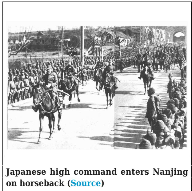
Japanese high command enters Nanjing on horseback

The next day they began shooting a documentary film, Nanjing [Nanking] that presents the battle as framed by the Japanese high command. The crew had just completed an earlier documentary, Shanghai, on the battle that paved the way for the advance of Japanese forces toward Nanjing. Dispatched to Nanjing without supplies, the reign of terror began en route with Japanese forces attacking villages en route to secure food and supplies. In Nanjing, shooting of the film continued to January 4, 1938 and the film was rushed to completion for release in Japan on January 20. (Can it also have been distributed for viewing in Chinese cities? Or for international distribution?) Long believed to have been lost, a print was discovered in Beijing in 1995, although with 10 minutes of the original missing. Nippon Eiga Shinsha made it available as a DVD. The present film superimposes primitive English translation . . . whether provided at the time of its release or years later, presumably for international distribution.