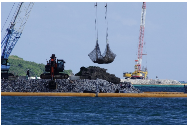
K-1 and N-5 Seawall Construction, © Yamamoto Hideo

The Okinawa Defense Bureau, however, repudiated the Governor’s claims. It insists that the land reclamation permit which was issued by former Governor Nakaima Hirokazu in December 2013 enabled the Defense Bureau to transport landfill materials by sea from Oku port to Henoko-Oura Bay. 4 They noted that Governor Onaga had lost his lawsuit in the Japanese Supreme Court in December 2016 over his withdrawal (torikeshi) of the land reclamation permit. 5