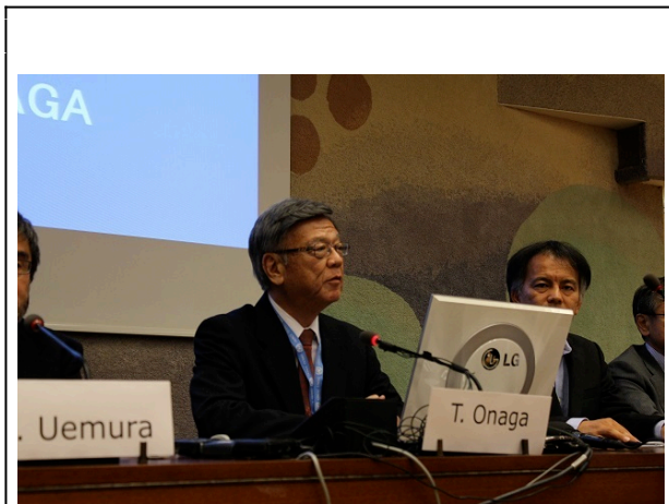
Governor Onaga addressing the United Nations, © Hideki Yoshikawa

latest move can also be understood as a manifestation of the Onaga administration's frustration with the fact that, while stressing the importance of the U.S.-Japan Security Treaty, most governors of Japan's other prefectures are unwilling to host (or even discuss hosting) U.S. military bases or training in their prefectures. In other words, they persist in "free riding" on the US-Japan Security Treaty at Okinawa's expense. 24 The Onaga administration's alternative plan likely incorporates the recommendation laid out by the Tokyo and Washington-based think-tank, "New Diplomacy Initiative," which calls for development of a "new rotational system" for the U.S. Marine Corps stationed in the Pacific. 25 Apparently, the Onaga administration is contemplating presenting its alternative plan during Governor Onaga's visit to Washington D.C. in March 2018.