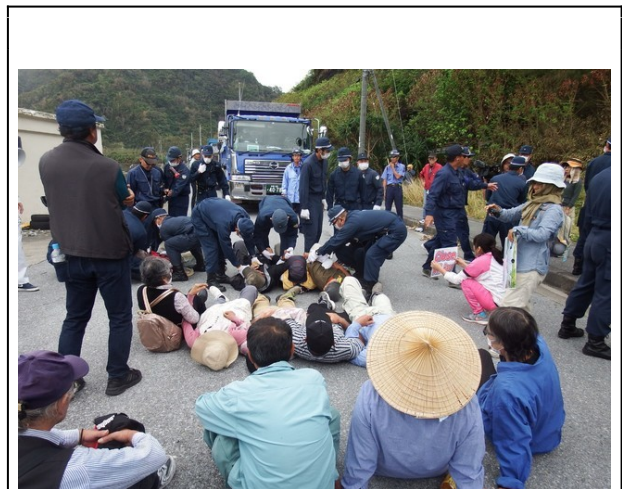
Protesters at Oku Port

On the other hand, a growing number of people feel angry and betrayed. Many now question whether Governor Onaga and his government are sincere and serious about stopping the base construction. These reactions are evident especially among protesters who are already weary from daily protests, continuing now for years, at Camp Schwab and Henoko-Oura Bay, as they now have to head off also to the distant port of Oku.