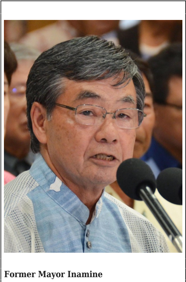
Former Mayor Inamine

build up momentum by winning re-election of Onaga Takeshi as prefectural governor in November, and then, with our colleagues at the Camp Schwab gate-front protest, we would press the government to abandon the construction of the Henoko base.