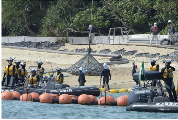
Base Construction begins at Henoko, April 2017

Creating a feeling of spreading helplessness, they set about gathering the votes of specialized sectors, with the LDP working on business and workplaces and Komeito on individual residences, each its own speciality. The decision by Komeito, which in the last election had adopted a “free vote” stance, to recommend the Toguchi candidacy was a large factor. Komeito convened a reported 1,000 activists from elsewhere in Okinawa or Japan proper, brought them together in the Soka Gakkai lodge in neighbouring Onna village and day after day dispatched between 100 and 200 rental vehicles to Nago, penetrating to the depths of this far-flung city, “gently,” or at times forcefully, persuading and conveying people there and then to cast their vote in advance. They appeared to know in which houses there were old or invalided people and which households were welfare recipients, and adapted their message accordingly.