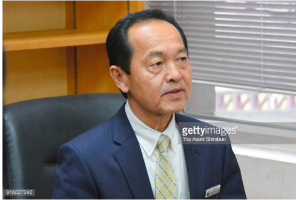
Mayor elect Toguchi Taketoyo

The election was remarkable in many respects. No national government had ever intervened so intensively to sway a local self-government outcome as had the Abe government for this election, dispatching top figures of government and ruling party to press the Toguchi cause and to promise generous rewards for cooperation. Following a plan attributed to Chief Cabinet Secretary Suga Yoshihide, Toguchi avoided any mention of the Henoko project, refused to debate his opponent, and stressed the economic benefits his close contacts with the national government would bring the city, emphasizing improved waste management and better child and aged care facilities. The candidate and his powerful sponsors in the national government made every effort to convey the impression that the election was a local matter, yet such efforts were belied by the importance and the national status of those sent from Tokyo to plead Toguchi's cause. In other words, fearful that the people would reject its design, both the candidate and the government concealed it. The election was fundamentally anti-democratic.