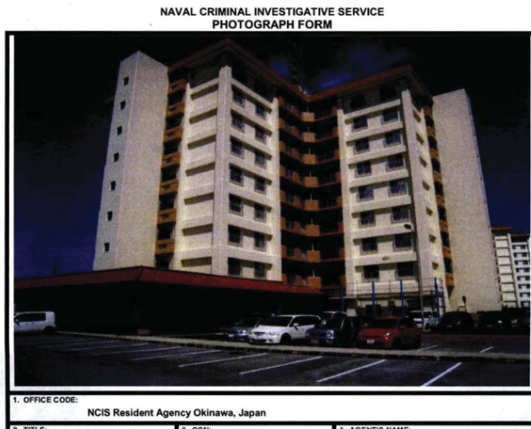
NCIS photograph of the military housing block on USMC Camp Courtney where the June 2015 assault took place.