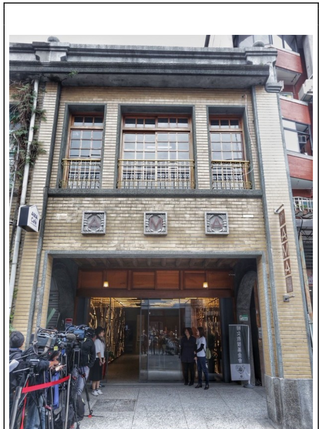
Entry Way to Ama Museum in Taipei.

TWRP committed itself to establishing a site to commemorate Taiwan’s comfort women as early as 2004. 64 The organization needed to address many obstacles to get to December 2016 when the museum finally opened. The Museum consists of two main exhibition halls.