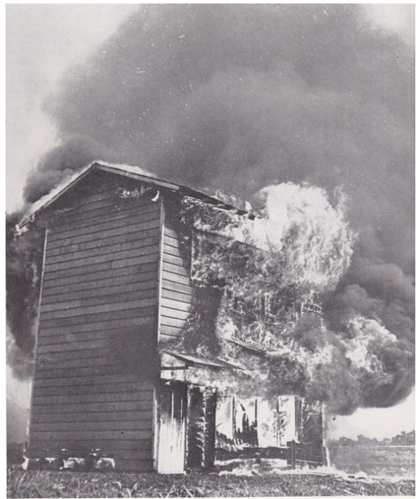
M-69 incendiary tests on Japanese style structures at Dugway Proving Ground. This and all subsequent images are from Standard Oil, Design and Construction of Typical German and Japanese Test Structures at Dugway Proving Grounds, Utah, 1943 . Via JapanAirRaids.org

Napalm, firebombing, Dugway Proving Ground, Japanese Village, World War II, precision bombing, civilian bombing, Tokyo air raids.