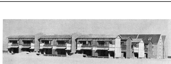
The completed German-Japanese Village.

Results were categorized in three ways: “any fire beyond control of the well-trained and properly equipped fire guards in 6 minutes was classified an A fire; a fire which was ultimately destructive if unattended was a B fire; and a fire judged nondestructive was a C fire.” The M-69 produced 37% A fires in German structures and 68% in the Japanese structures, and was judged overall to be the best. (In both cases, the other bombs produced no A fires.) As a result, plans for using the bomb on Japan were drawn up by the Army Air Force as early as the fall of 1943. 68 Tables 1, 2, and 3 summarize comparative data from the UK and US testing, and show how Dugway’s testing could have been readily interpreted as the most effective.