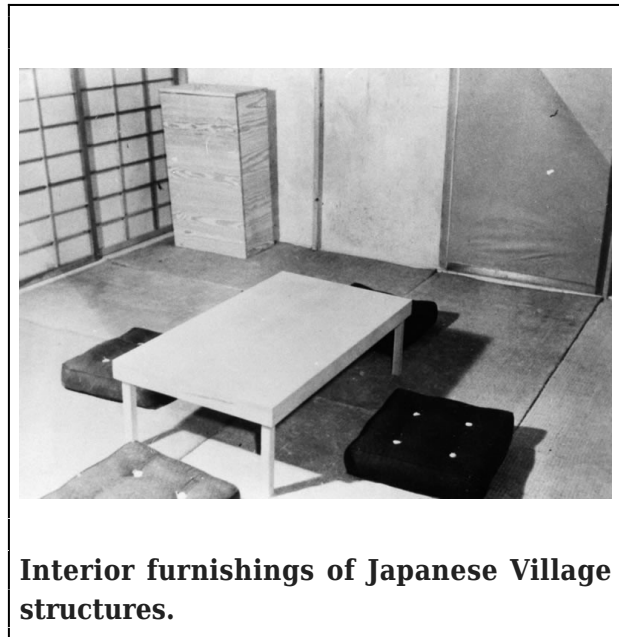
Interior furnishings of Japanese Village structures.

from the Japanese Village for furnishing their own apartments. The most notable inclusion on the list, however, is tatami (straw floor mats).