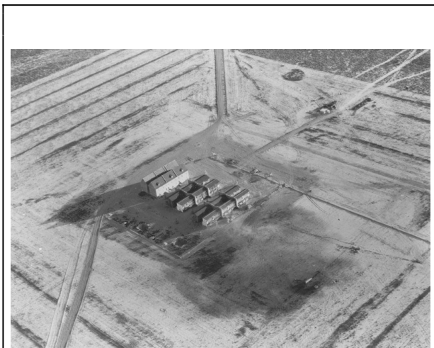
A closer aerial photo of German-Japanese Village where the viewing bunker can be seen.