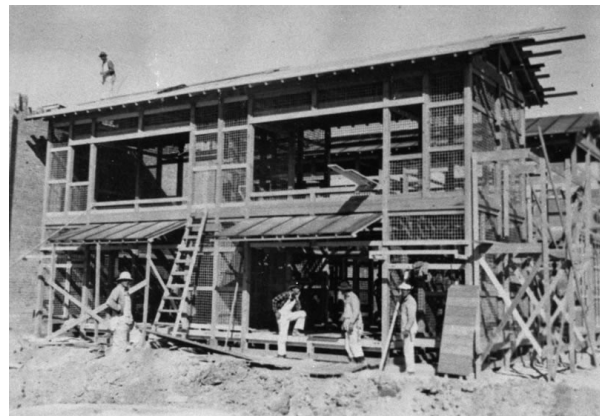
Workers utilize traditional Japanese architectural styles in the Utah Desert, 1943.

All in all, 12 Japanese double-dwellings consisting of 24 tenement-style residences and 6 German apartments were constructed. These structures were designed, according to Standard Oil, to represent living quarters in Japanese industrial districts. No structure meant to represent industrial facilities was built. Emphasis was exclusively on civilian populations.