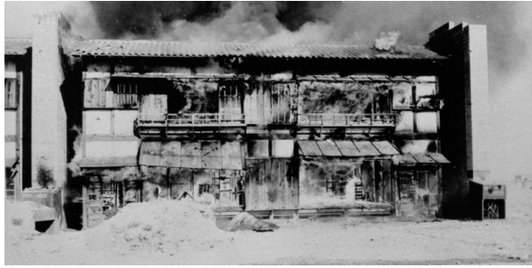
Incendiary testing on Japanese Village.